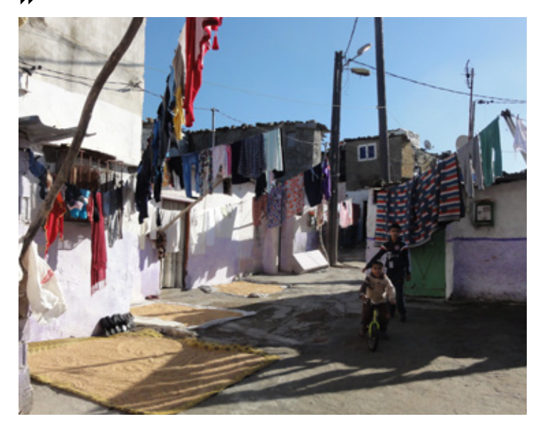
Figure 5: Morocco's bidonvilles have developed over time as this high-end construction in Er-Rhamna shows. Author's picture, March 2017.