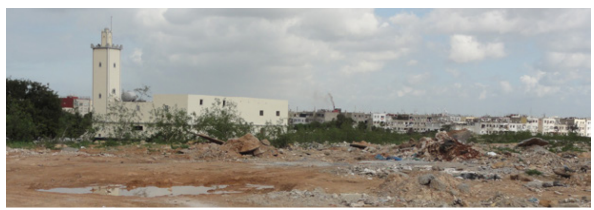
◆ Figure 3: The mosque is the only remaining building of Karyan Central. Author's picture, February 2017.

projects: 'Access to ownership allows slum dwellers to improve their living conditions and induces a new social behaviour as well as an increased involvement in local affairs' (Al Omrane 2010: 6). Obviously, this approach mirrors a classic understanding of de Soto's theory on the significance of formal property ownership. Similarly, the Ministère de l'Habitat, de l'Urbanisme et de la Politique de la Ville (MHUPV) (2012: 29) asserts, 'The living conditions of PVSB [VSB programme] recipients have markedly improved thanks to their access to property-ownership.' Here again, it becomes visible that the VSB programme builds on the property-rights approach, which is based on a black-and-white understanding of formality/informality.