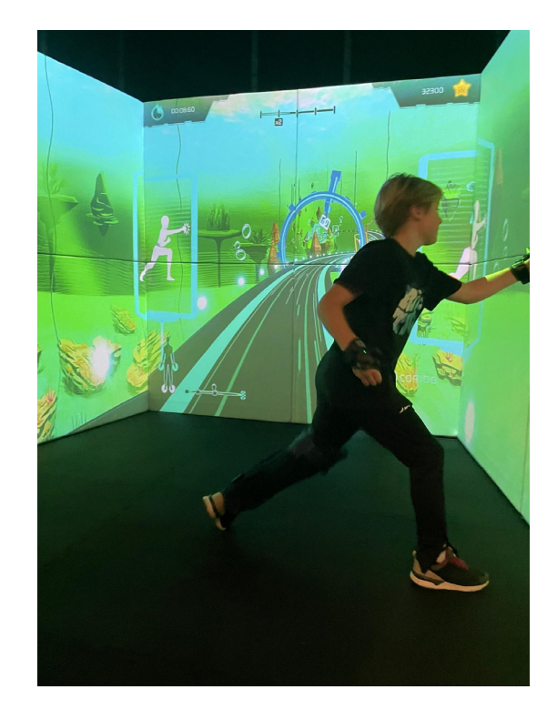
Figure 1. Student playing "Sphery Racer" in the ExerCube by Sphery Ltd. (Au, Switzerland)

project the virtual game scenario and provide an interface for generating in-game actions [44]. In contrast to many other exergames, which are played in front of a screen using a controller, the ExerCube allows the players to fully immerse themselves in and interact with the virtual game scenario through whole-body movements.