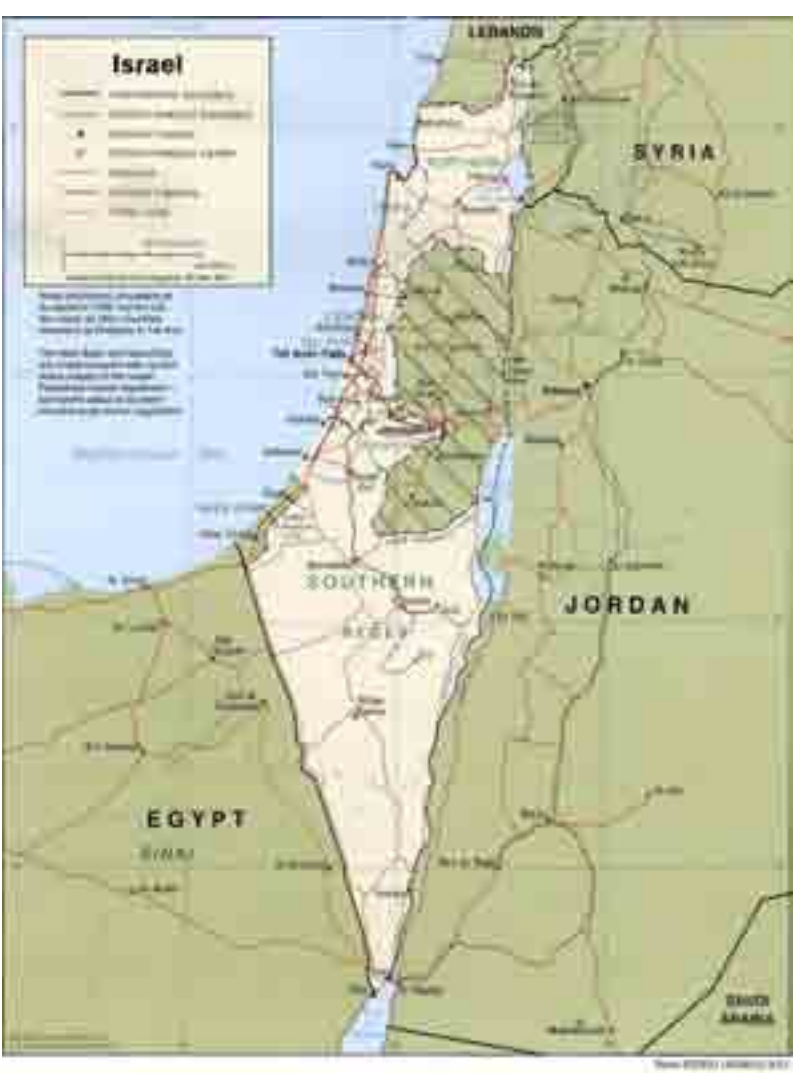
Israel Political Map (Source: Perry-Castaneda Library Map Collection) http://www.lib.utexas.edu/maps

There are nearly four million Palestinians living in the West Bank and Gaza Strip. Moreover 3.7 million Palestinians live in Lebanon, Syria and Jordan.<sup>19</sup> Since the establishment of the State of Israel they have been fighting to have their own state. Currently the area in question includes the West Bank and Gaza Strip which were taken from Egypt and Jordan in the 1967 Arab-Israeli war.<sup>20</sup> These territories are referred to by Palestinians occupied as territories. Israel claims their status as "disputed territories". Current law status of the West Bank and Gaza Strip is based Israeli-Palestinian upon the Interim Agreement which also established Palestinian administration in most parts of the West Bank and Gaza Strip. Permanent status of the occupied territories is to be determined through further negotiation.<sup>21</sup>