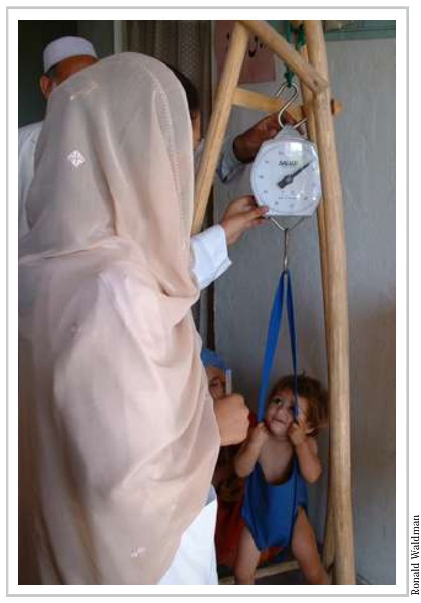
at MCH clinics and basic health centres is not clear.

vitamin A deficiency in children. However, a nutrition survey in Badghis Province found a relatively low 2.6% of children with at least one clinical sign of vitamin A deficiency. Other vitamin deficiencies, including riboflavin deficiency and vitamin D deficiency (rickets), are at least a potential problem in Afghanistan, and outbreaks of vitamin C deficiency (scurvy) have been documented quite recently. Whether or not dietary supplementation with these vitamins will be provided through routine prevention services