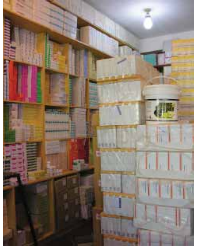
A drug wholesaler's shop

and overprescription and iatrogenic illness.