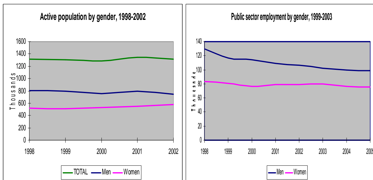
Figure 1: Albanian labor market trends

Albania is a particularly interesting setting where to study the impact of migration on domestic (formal and informal) labor market by gender. This country has been largely affected by the passage on the market economy at the beginning of 1990 and key changes over the process have occurred in the local labor market. Like in many other transition economies, the country experienced a substantial decline and stagnation in labor force participation in the new labor market. Public sector employment has declined enormously during the transition period but job growth in the private sector has been too slow to compensate (see Figure 1).