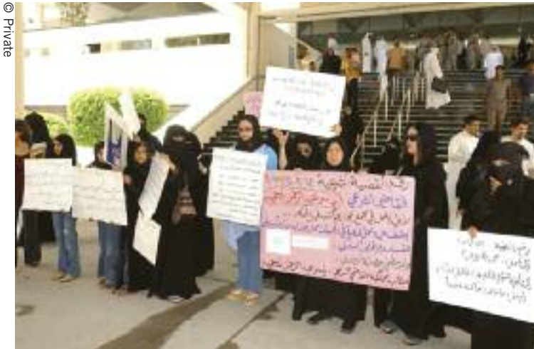
Women and children affected by rulings of the family courts outside the Ministry of Justice, Bahrain.

gathered peacefully in Tehran to commemorate International Women's Day. Scores of women were beaten. Journalists who filmed the event were reportedly arrested and released only after their film and photographs had been confiscated. Nine of those injured lodged a complaint with the Public Prosecutor's Office in May 2006.