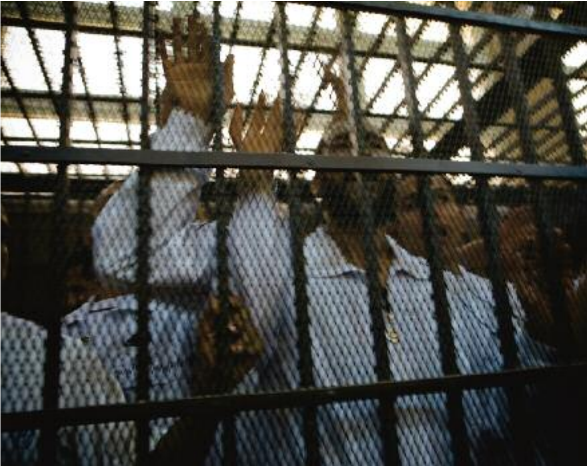
Defendants in the trial of 49 Mahalla protesters in court in Tanta, Egypt, 9 August 2008.