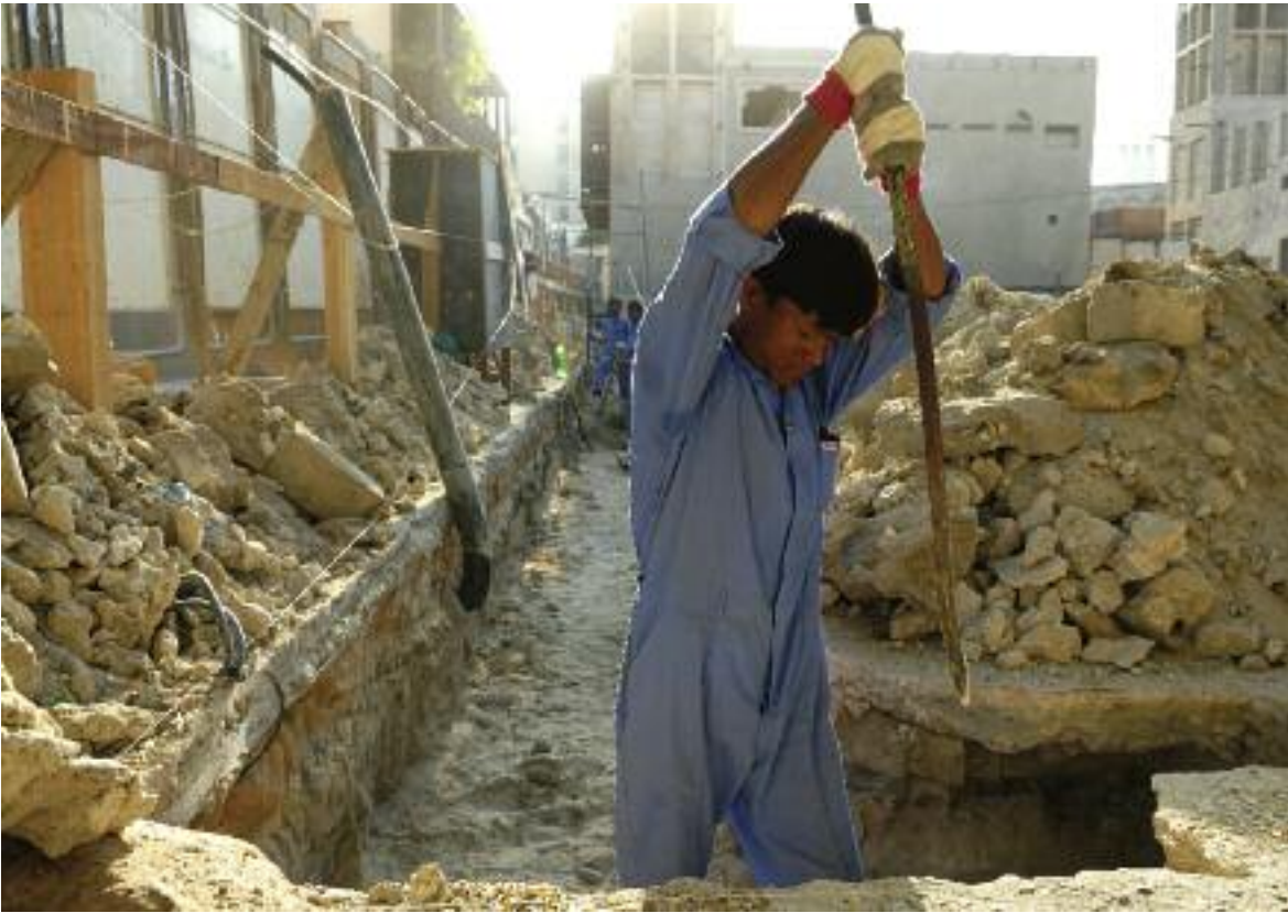
A migrant worker on a construction site in Dubai, United Arab Emirates.

In September the government announced it would consider changing the sponsorship scheme to improve the lives of migrant workers.