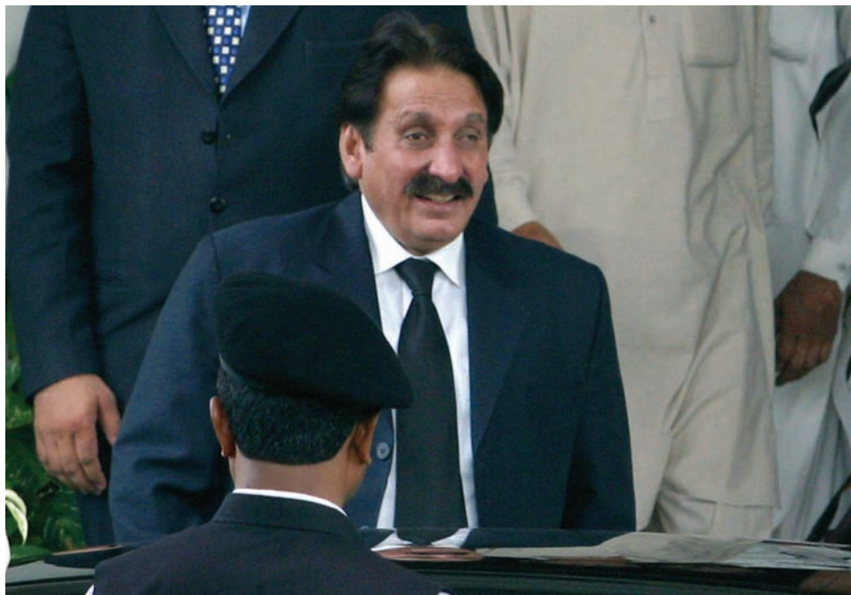
Deposed Chief Justice of Pakistan Iftikhar Mohammed Chaudhry.