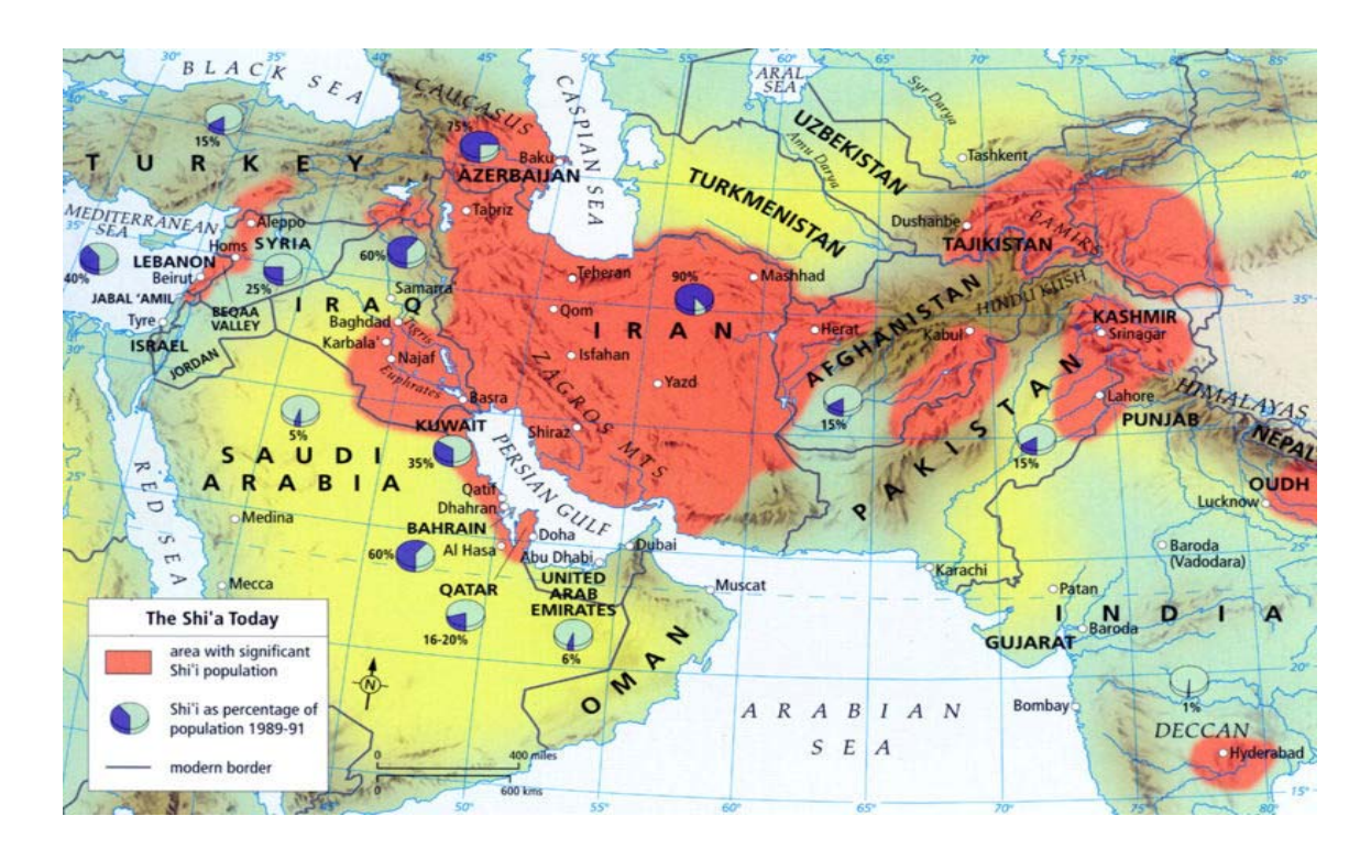
\frac{Figure~3}{Iran~and~the~geographical~distribution~of~Twelver~Shi'ites~in~the~contemporary~Middle~East,} Central Asia and on the Indian subcontinent ^{45}

and historical experience. Therefore, when dealing with the political realities of the Middle East, one should steer clear of rhetoric as it is all too often an empty shell.