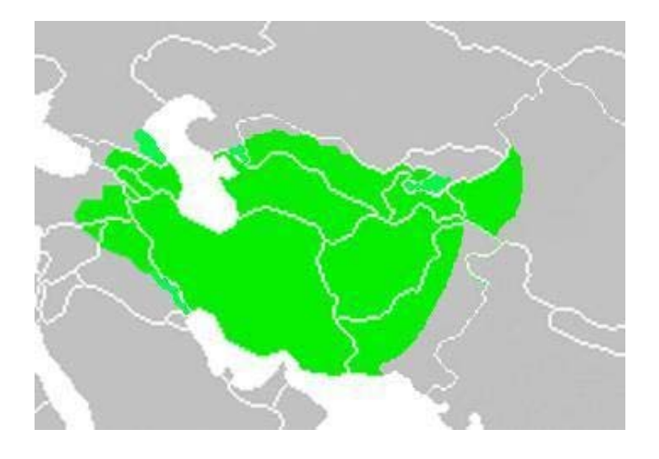
\label{eq:Figure 1} {\underline{\bf Figure~1}} The concept of Greater Iran ^6

one hand and a Shi'ite political assertiveness in the region on the other, it is also crucial to be aware of the circumstance that the concept of Greater Iran reaches back far into the pre-Islamic period when Iran ruled over areas that were one of the first world powers in human history. The historical Lands of Iran—or Greater Iran—have always been known in the Persian language as Īrānshahr or Īrānzamīn . Both terms refer to the Iranian plateau in addition to regions that had been historically under significant Iranian cultural influence, roughly corresponding to the territories ruled by the ancient Parthians and Sasanids—i.e. in addition to Iran proper, also the Caucasus, Mesopotamia (Iraq), Central Asia and large parts of what is now Pakistan and Afghanistan, and conforming to the Persian historical understanding of the full territorial extent of Iran. The capital of this entity was, at times, situated in what is now Iraq.