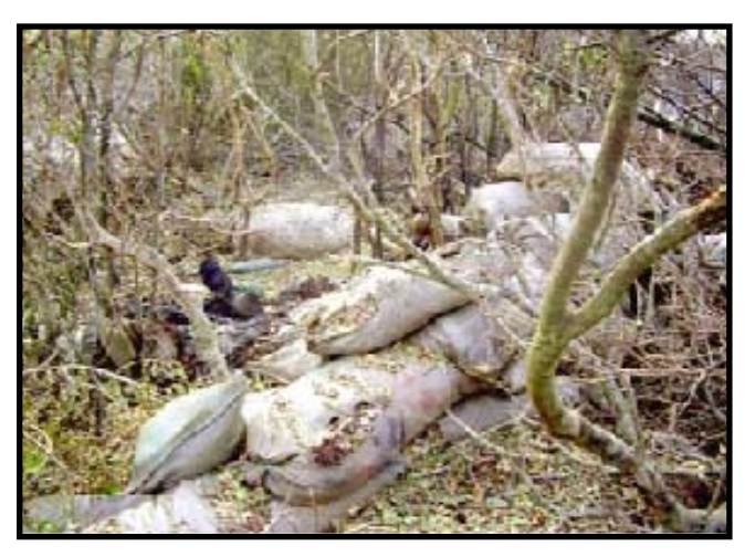
Figure 6. Hezbollah Bunker Entrance.