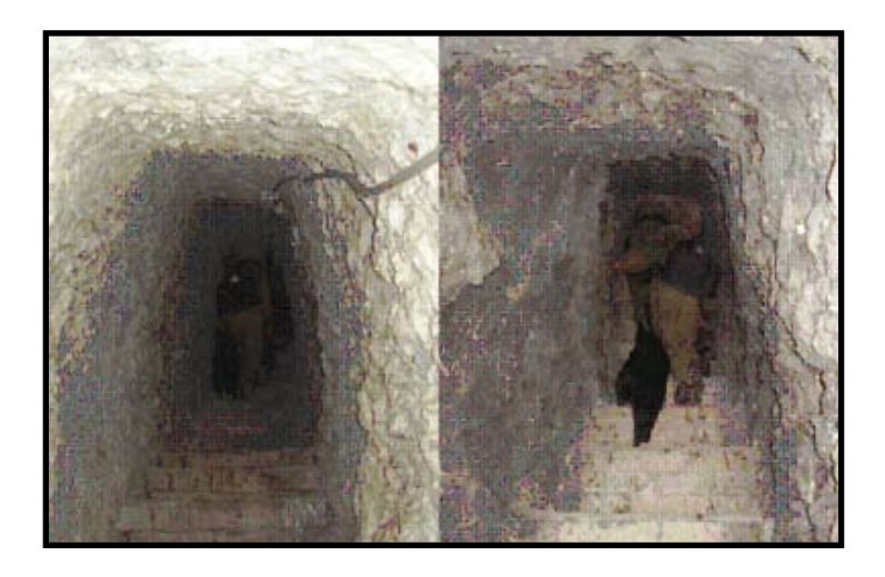
Figure 10. Hezbollah Bunker Interiors.