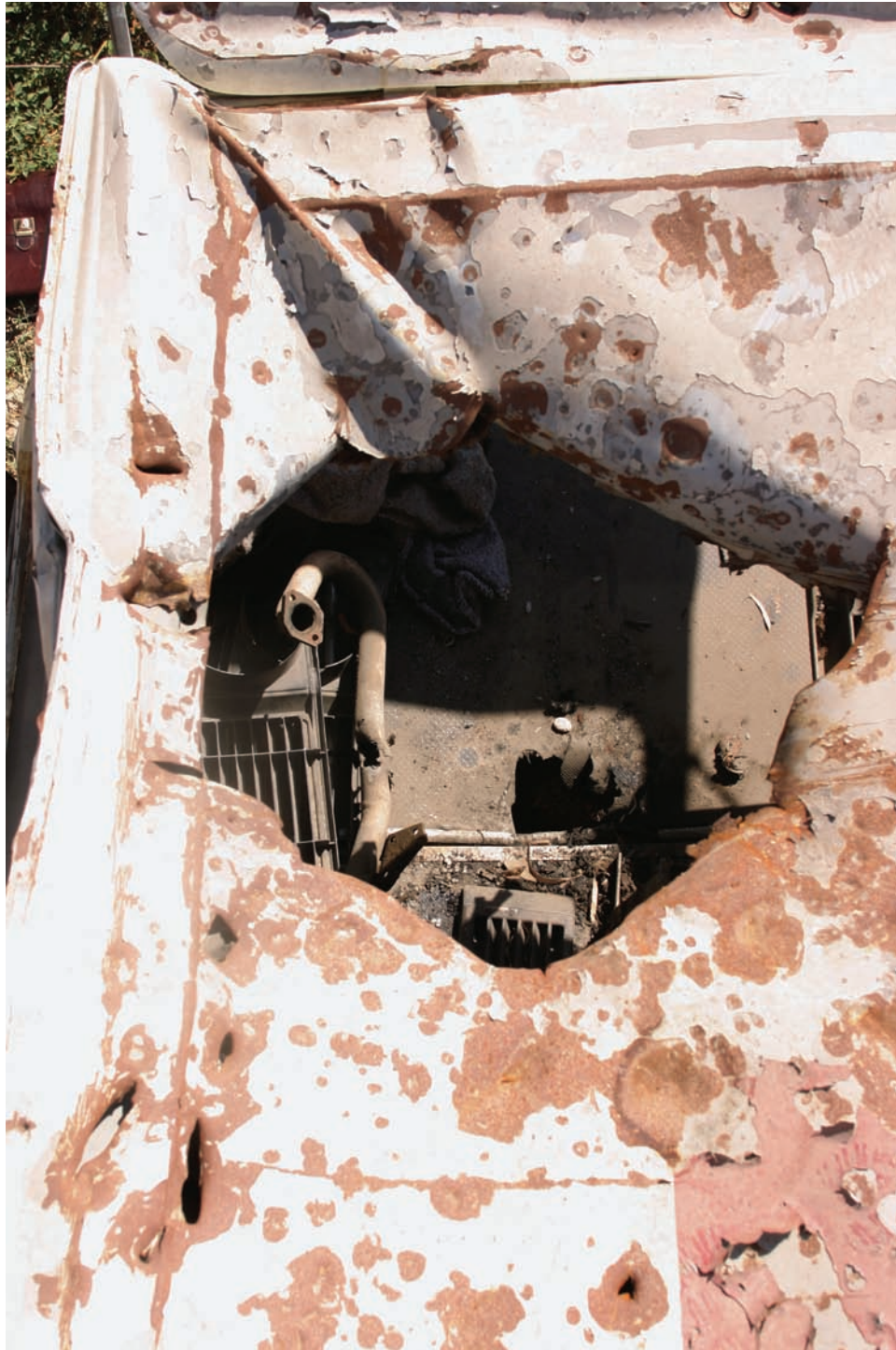
The roof of ambulance 777, showing the entry and exit points of the missile. The location of the exit point of the missile corresponds with the missile impact location on the gurney mattress on which Ahmed Fawaz was located (see picture below).