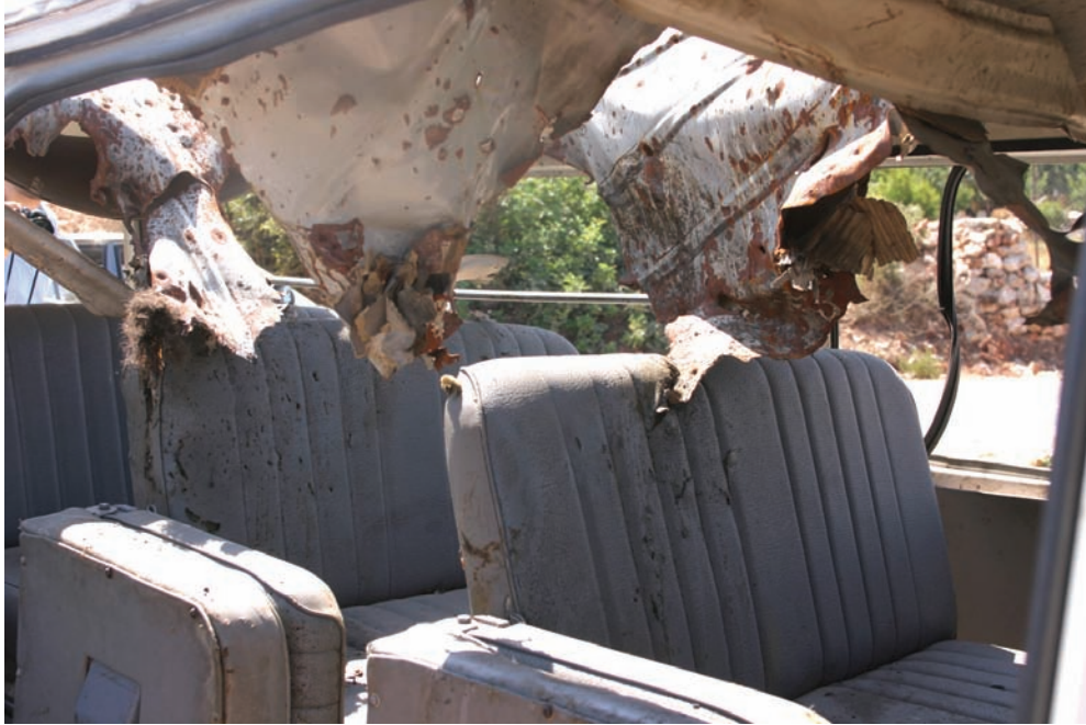
The interior of the van carrying the Shaita family, which was struck by an Israeli missile on July 23, killing three persons. Like the Qana ambulance, the van was struck in the middle of the roof (by two missiles), but the missiles caused only limited destruction inside the van.