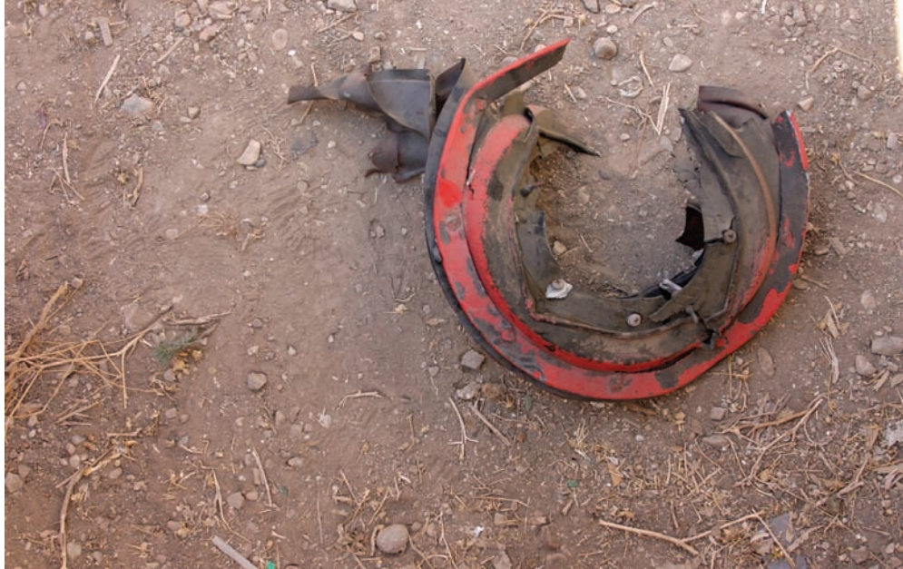
A close-up of the destroyed air vent of ambulance 782.