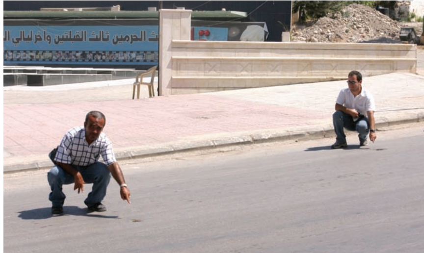
The location of the two missile impact craters outside the Qana memorial (visible in the background). The location of the missile impact craters corresponds with testimony from witnesses on the location of the two ambulances, with ambulance 777 parked in front and to the left of ambulance 782.