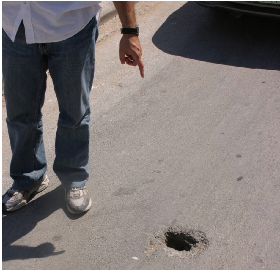
A close-up picture of the missile impact crater below where ambulance 777 was reportedly parked. The missile round penetrated deeply into the pavement.