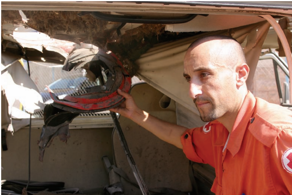
A Lebanese Red Cross worker holds the destroyed air vent, penetrated by an Israeli drone missile, next to the hole in the roof of ambulance 782.

Human Rights Watch examined the struck ambulances, which were stored at the Red Cross parking lot in Tyre, and found that the damage to the vehicles also supports the accounts of the eyewitnesses. Both ambulances clearly show missile entry points on the roof, with ambulance 782 struck directly through the Red Cross emblem and ambulance 777 towards the rear of its roof, and smaller missile exit points on the floor of the ambulances. Human Rights Watch found the rooftop air vent of ambulance 782, which showed that it had itself been penetrated by a missile; the circular vent was about 30 cm in diameter, and was located at the center of a much larger red cross that covered the entire roof of the ambulance. Human Rights Watch located the gurney on which Ahmad was lying when the missile struck and severed his leg, which clearly shows the impact of a missile.