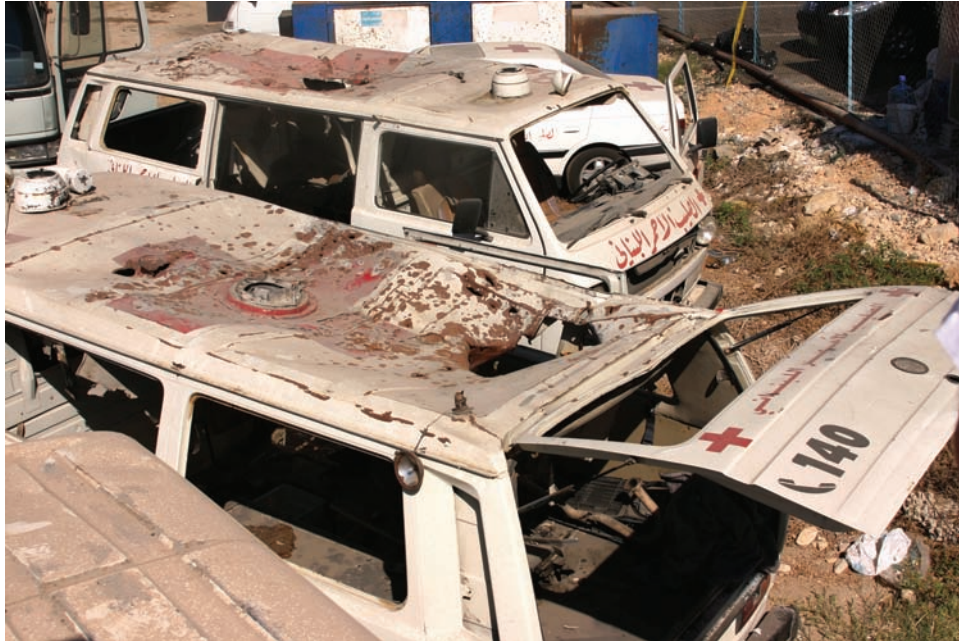
Ambulances 782 (in the rear) and 777 (in the foreground) in the parking lot of the Lebanese Red Cross in Tyre.

also conducted a detailed examination of both ambulances that were reported hit. On September 14, Human Rights Watch researchers visited the scene of the alleged attack and found physical evidence there corroborating the accounts of the eyewitnesses. Human Rights Watch has also met with representatives of the ICRC to discuss their role in the incident.