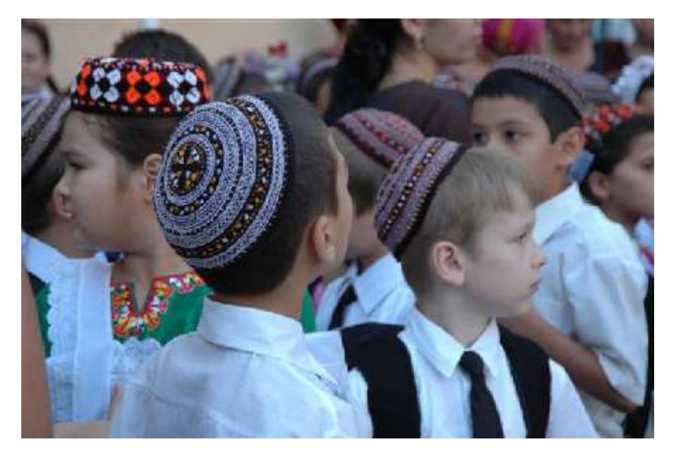
A Russian schoolboy wearing a traditional Turkmen skull cap (Takhya)

institutions. Farid Tukhbatullin told Amnesty International: "Especially the dress for girls is quite expensive considering that the cloth and the emroidered collar are expensive. But parents have to pay, otherwise their child will not be admitted to school".