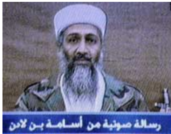
Text at bottom reads "Voice message from Osama bin Laden." Al Jazeera satellite channel broadcast 10/6/02.

transition" in the GCC states: mortality rates have fallen sharply, but fertility rates have fallen only very moderately and remain very high by international standards. Past high rates of population growth fifteen to twenty years ago translate into very rapidly growing labor supplies today. The private sector cannot currently take up the slack in employment creation. The sector is a) too dependent on state largesse and b) relatively too small to do so. Most importantly, however, the countries of the Gulf have limited comparative advantages in non-oil goods or services. Wage rates, seriously inflated by past oil rents and current consumer subsidies, are far too high to compete in low wage activities, but skills are too low to compete in more sophisticated activities.