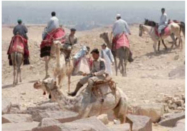
Egyptian policemen patrol on camels beside the Chephren pyramid in Giza in the outskirts of Cairo Friday, April 19, 1996. Security around tourist sites has increased discretely after a suspected Islamic radical group killed 18 Greek tourists in an hotel nearby Thursday.

After the attacks of September 11th, attempts at analysis of any kind were often denigrated as symptoms of cowardice or treason. Pundits and policy makers suggested that to argue that phenomena such as al-Qaeda had social roots was to excuse, or even condone, their apocalyptic actions. As the political scientist Thomas Homer-Dixon pointed out, such arguments are “grade-school non sequiturs” 2 . After all, historians who study Nazism do not justify Auschwitz, and students of Stalinism do not exonerate the perpetrators of the Gulag. Understanding is simply better than the alternative, which is incomprehension. If we fail to grasp the forces behind the attacks of September 11, we will fail to respond wisely.