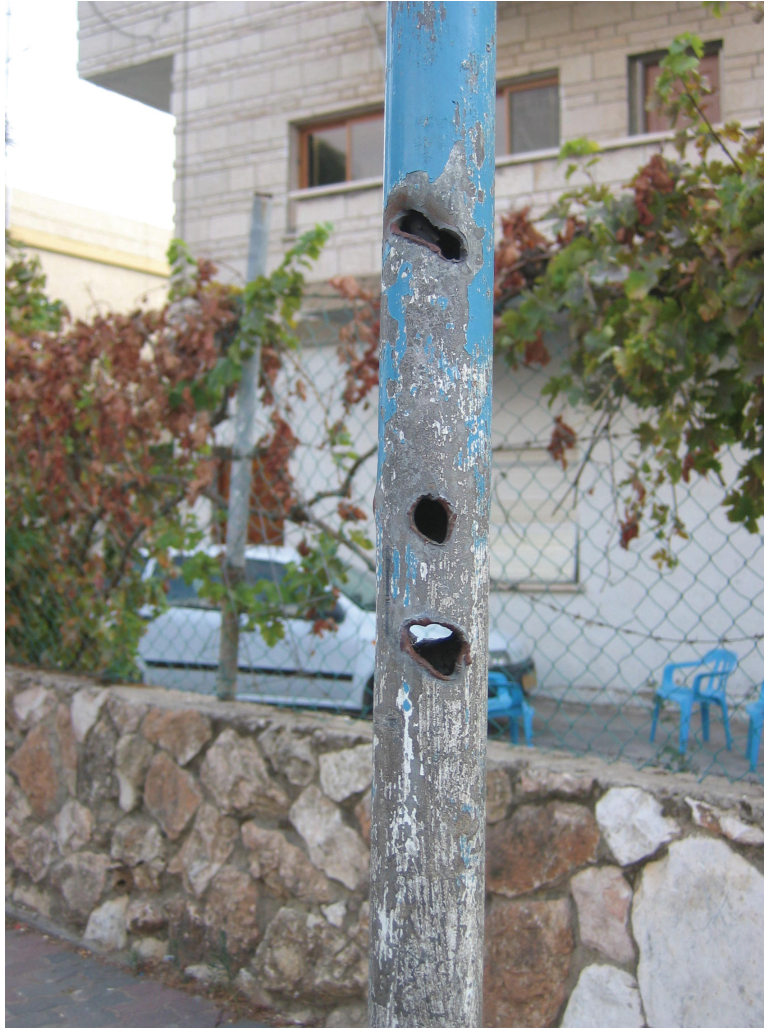
A pole on a sidewalk in Majdal Krum that was penetrated by steel spheres and shrapnel from a rocket that landed on the street nearby on August 4, 2006, killing two men.

Visiting the site of the attack on September 30, Human Rights Watch saw a filled-over hole in the street that Hussein said the rocket had caused, as well as shrapnel damage on nearby poles and street signs.