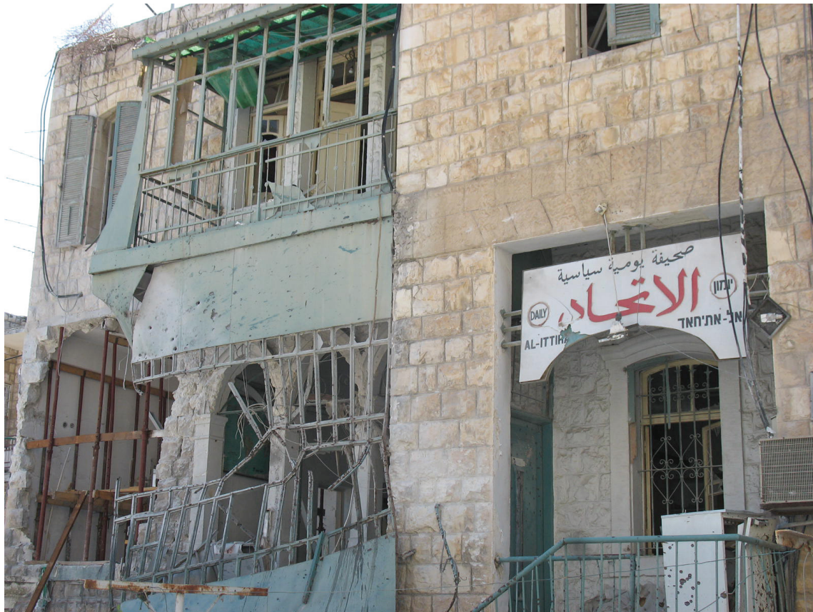
A building in the Wadi Nisnas neighborhood of Haifa, housing the archives of al-Ittihad newspaper, after a rocket struck on August 6, 2006, killing two elderly persons next door.

If Hezbollah had indeed been targeting military or industrial objects in Haifa some of the time, it expressed no regret for the civilian casualties it was inflicting until its rockets first hit the majority-Arab neighborhood of Wadi Nisnas on August 6, killing two residents and seriously wounding a third. It was then that Hezbollah secretary-general Nasrallah went on television to urge Arab residents to leave the city. (See chapter below on “Hezbollah’s Justifications for Attacks on Civilian Areas.”)