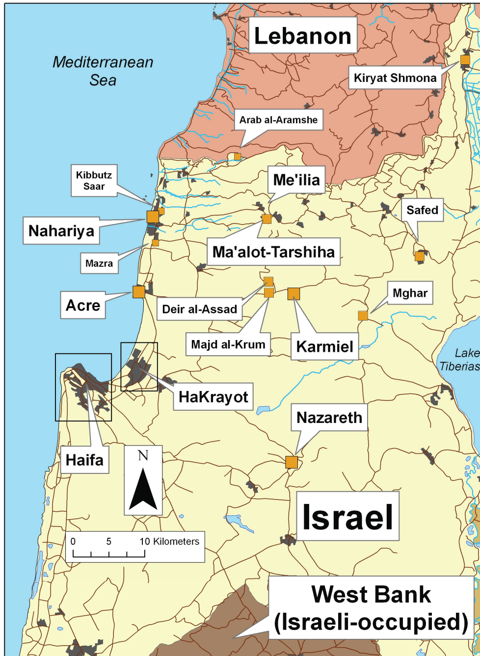
Northern Israel, showing locations struck by Hezbollah rockets that are described in this report. © 2007 Human Rights Watch