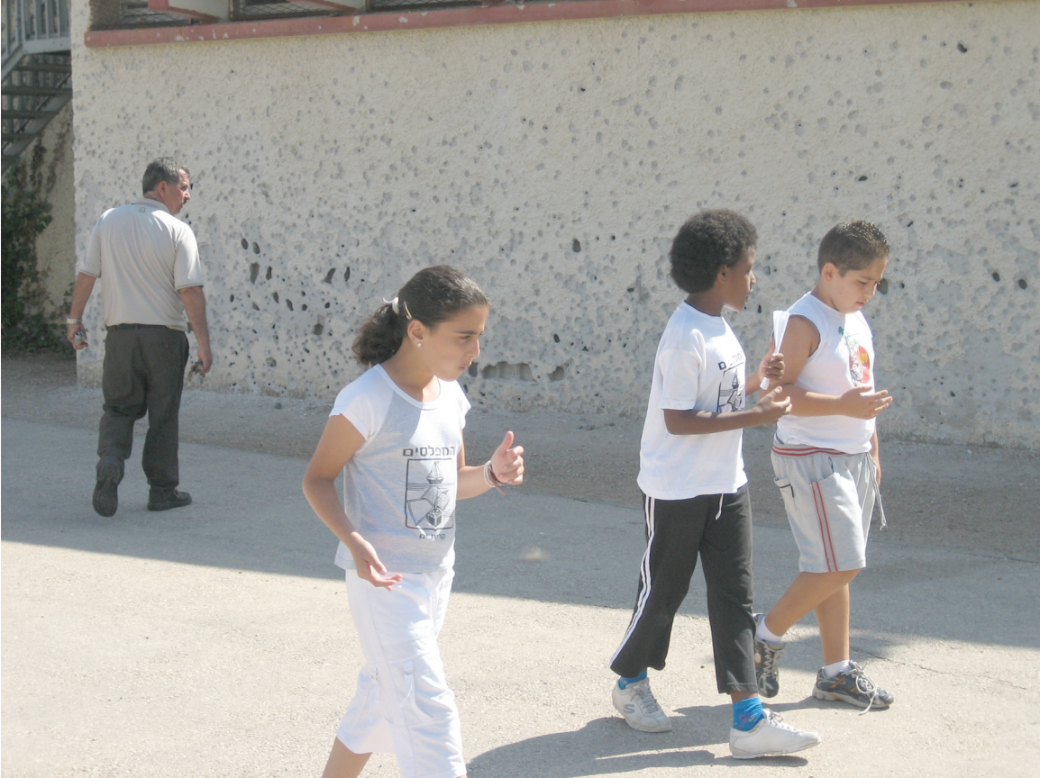
A wall of the elementary school “HaMiflasim” in Kiryat Yam, damaged by steel spheres from a rocket that hit an adjacent classroom on August 13, 2006.

Hezbollah provided no specific information about its attacks on Kiryat Yam or its intended targets there; it has not replied to Human Rights Watch requests for information about these attacks.