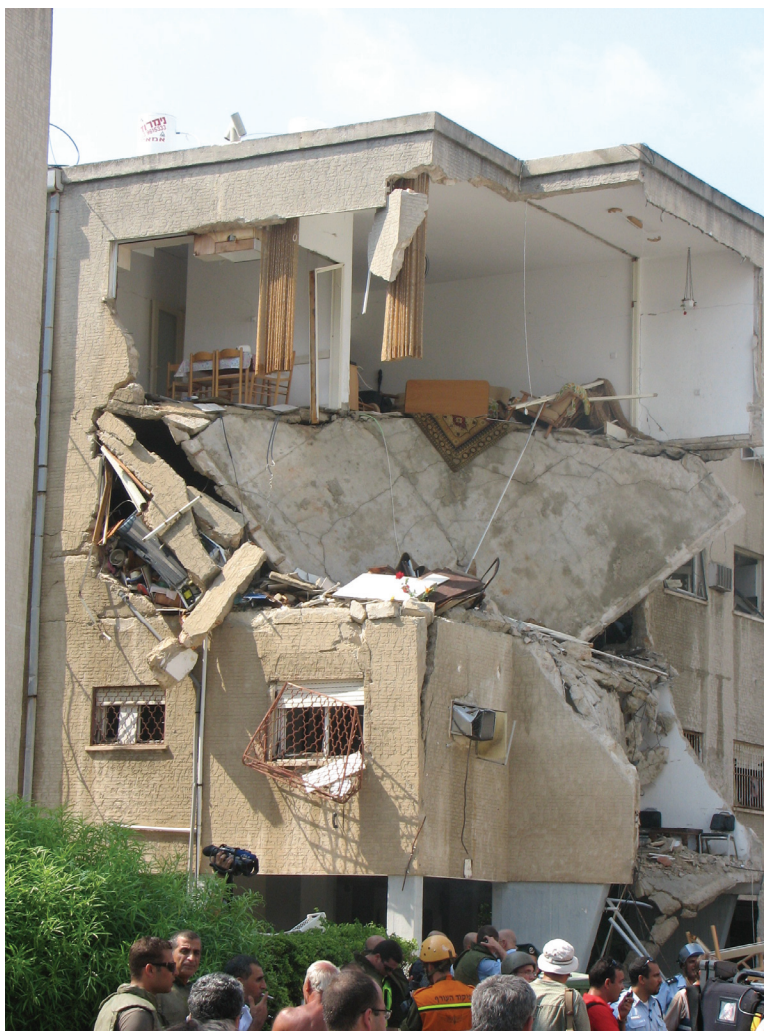
A rocket hit this apartment building in the Bat Galim neighborhood of Haifa on July 17, 2006, wounding six residents.

Haifa Police Chief Meri-Esh believes Hezbollah was aiming mostly at targets in the port area and that the relatively few rockets that reached the upper city were “over-shots.” The problem is that between the port area and the more affluent upper city neighborhoods on the hill are the lower residential neighborhoods, some densely populated. Thus, if Hezbollah was in fact trying to hit objects on the waterfront, its inaccurate rockets, flying a distance of thirty kilometers, stood a good chance of striking—and did indeed strike—residential and shopping neighborhoods just beyond.