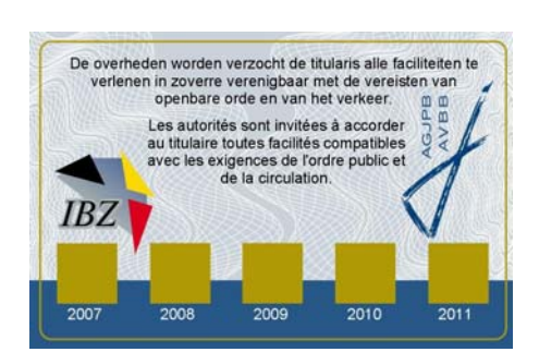
Belgium Press Card (back)