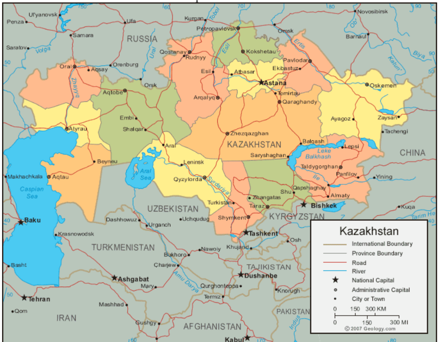
Map of Kazakhstan