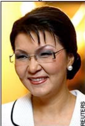
Photo: Dariga Nazarbaeva, oldest daughter of President Nazarbaev. 52