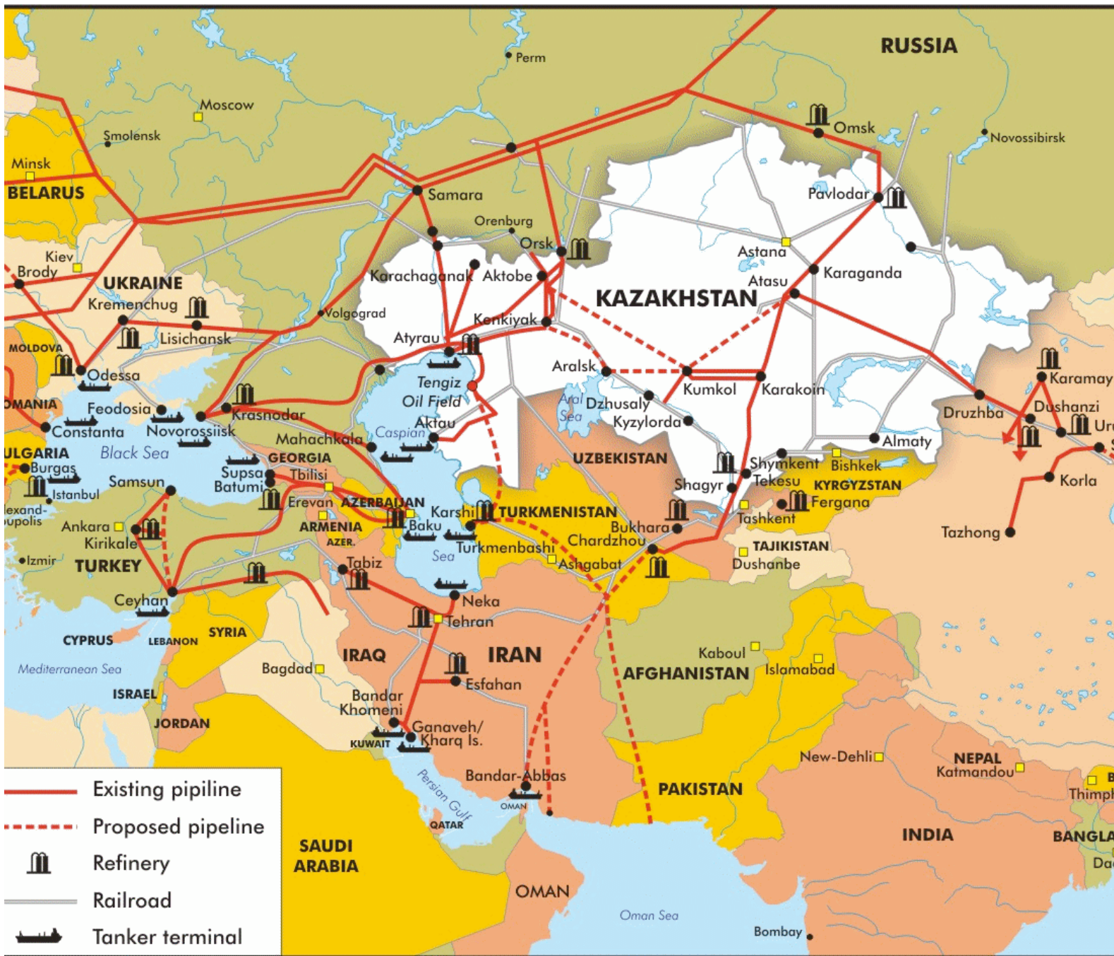
Figure 1: Map Existing and Planned Oil Pipelines