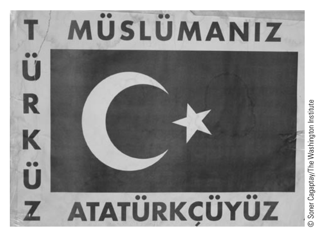
This image (taken by the author in the Emirhan district of Bursa, July 2005) shows how a sizable number of Turks have come to regard their national and Muslim identity as inseparable. Such images can be found throughout the country with increasing frequency.

If religion constitutes one part of the AKP's foreign policy calculus, domestic aspirations are another. The AKP has drawn a lesson from the events of 1997, when its predecessor, the Welfare Party (RP), was forced to step down from government through a show of popular discontent. The AKP now knows that it can stay in government only so long as it has strong popular support. The AKP's conundrum is that a majority of Turks do not yet support it. Therefore, it relies on an easy tactic of populist foreign policy that criticizes the