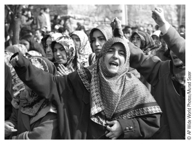
Protesters demonstrate against a ban on head scarves outside Istanbul University, February 24, 1998. Most of the women are wearing the turban style popularized by Islamist movements in other countries.

Secularism vs. radical Islam. Perhaps in anticipation of such developments, on August 30 and October 2, 2006, General Buyukanit named "reactionaryism," Turkish shorthand for Islamist fundamentalism, as the biggest threat facing Turkey.<sup>25</sup> Buyukanit added that the military has a constitutional duty to combat