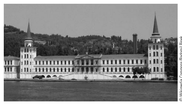
The Kuleli Military High School in Istanbul, established in 1845, is one of several Ottoman military schools established to provide secular Western curricula.

Outside the military sphere, however, the Ottomans maintained many old institutions, creating a dichotomy in Ottoman society. A few years before the