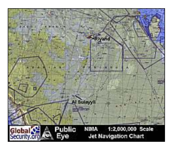
Figure 2 Al-Sulayyil Missile Base, 500 km SSW from Riyadh (From Ref <sup>30</sup>)