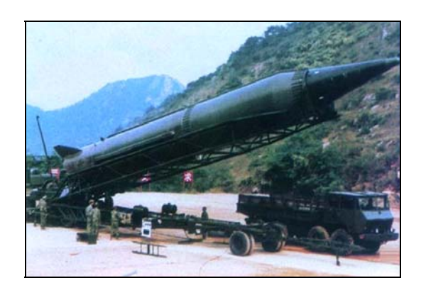
Figure 1 CSS-2 missile (From Ref <sup>25</sup>)

The CSS-2 missile is a single-stage liquid fueled system approximately 21.2 m long with a diameter of 2.25 m. It has a launch weight of 64,000 kg, requires two to three hours of pre-launch preparation time, and uses inertial guidance after launch. The missiles are considered mobile and require transporter vehicles. The Saudi missile purchase reportedly included 10 to 15 transporter vehicles and nine launchers.<sup>26</sup>