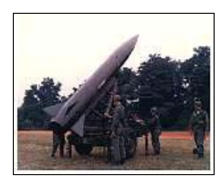
Figure 3 U.S. Army Lance Missile (From Ref <sup>48</sup>)

unarmed.<sup>45</sup> Later in 1985, AIPAC proved influential enough to persuade Congress to block the sale of additional F-15s to Saudi Arabia.<sup>46</sup> Throughout the 1970s and 1980s, U.S. arms transfers to the Saudis were often characterized by power struggles within the U.S. government. Saudi requests for military sales typically countered the congressional concerns that the arms would pose a threat to Israel. Despite Saudi assurances of the defensive nature of arms requests, congressional influence over the process resulted in the changes in the program content and several proposal packages.<sup>47</sup>