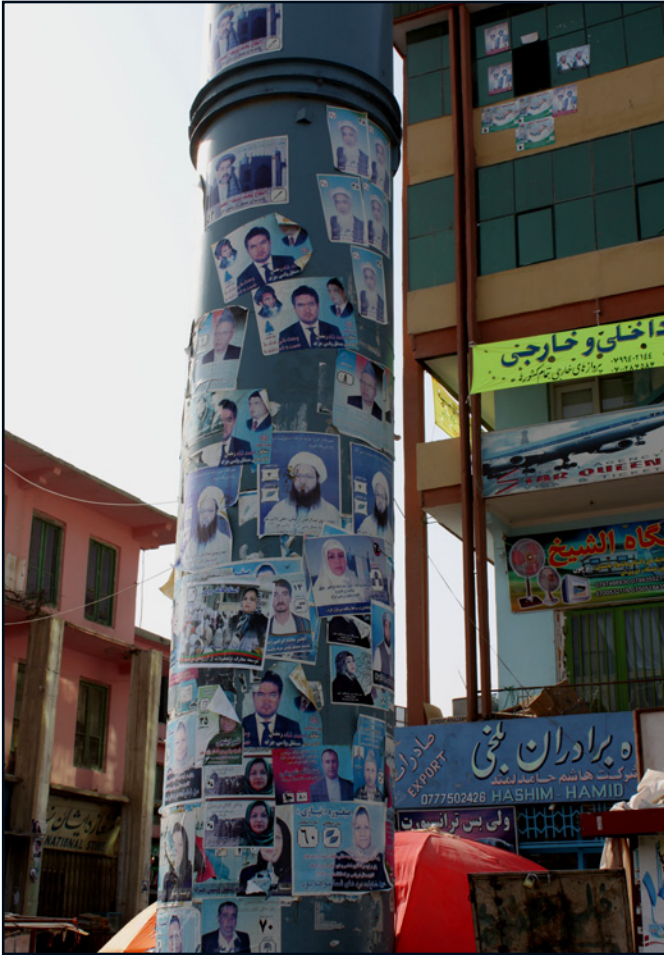
Campaign posters crowd street furniture in Mazar-i-Sharif, 2010

However, in statements about political parties, the problems raised appear to refer to broader concerns about the very principle of political competition, and many respondents appeared genuinely concerned about the idea of competition between parties or groups in general. This is due in part to the legacy of conflict in Afghanistan, and the way threatened or actual violence has been used as a tool of political negotiation. This is also reflected in perspectives on regular stand-offs in parliament between the government and different groups who would now classify themselves as in opposition. When respondents in a related AREU project on parliamentary elections talked about the rise of the so-called “opposition,” an overwhelming number stressed the need for reconciliation between the two groups in order to produce an effective, unified