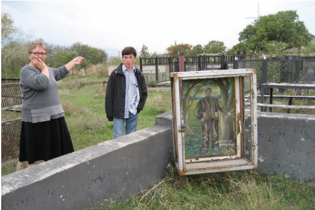
A woman injured during a Russian cluster munition strike on Ruisi on August 12, 2008, points toward the tree where she and three other women, also injured, had sought shelter. The gravestones of the adjacent church cemetery, pictured here on October 15, 2008, had holes from 9N210 fragmentation. The boy in the photograph came to report a nearby submunition dud.