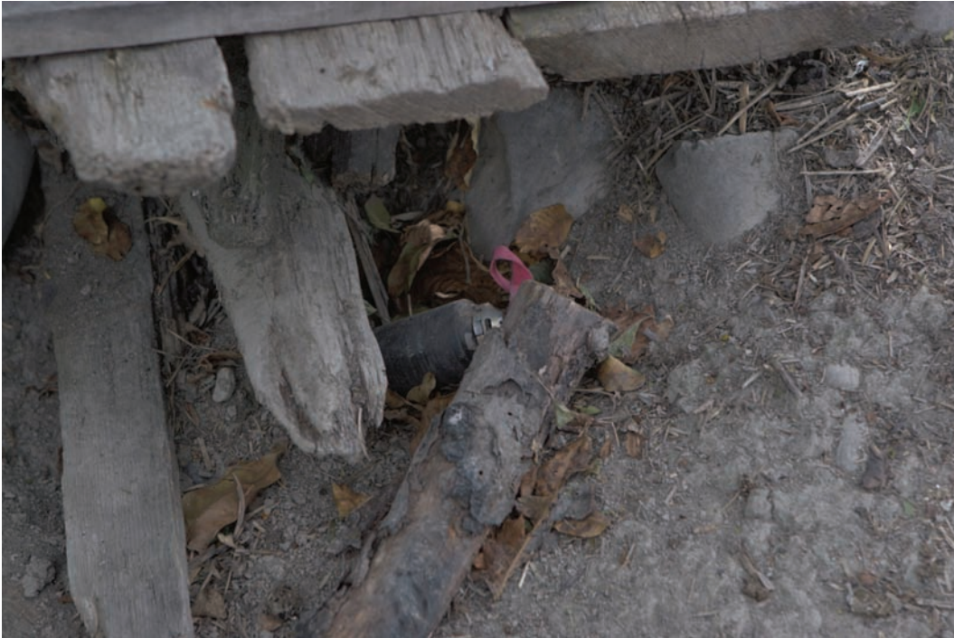
An unexploded M85, an antipersonnel and anti-armor submunition, lies next to a building in Shindisi in August 2008. Bought from Israel and launched by Georgia, this submunition is carried in a Mk.-4 160mm rocket.