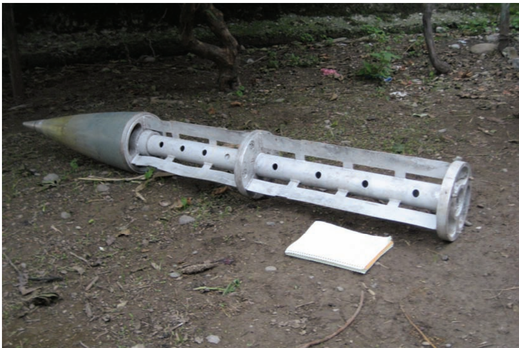
A local farmer found this Uragan (Russian for Hurricane) rocket near where four women were injured by a Russian cluster munition strike on Ruisi on August 12, 2008. The ground-launched rocket, shown here on October 15, 2008, carried 30 9N210 submunitions.