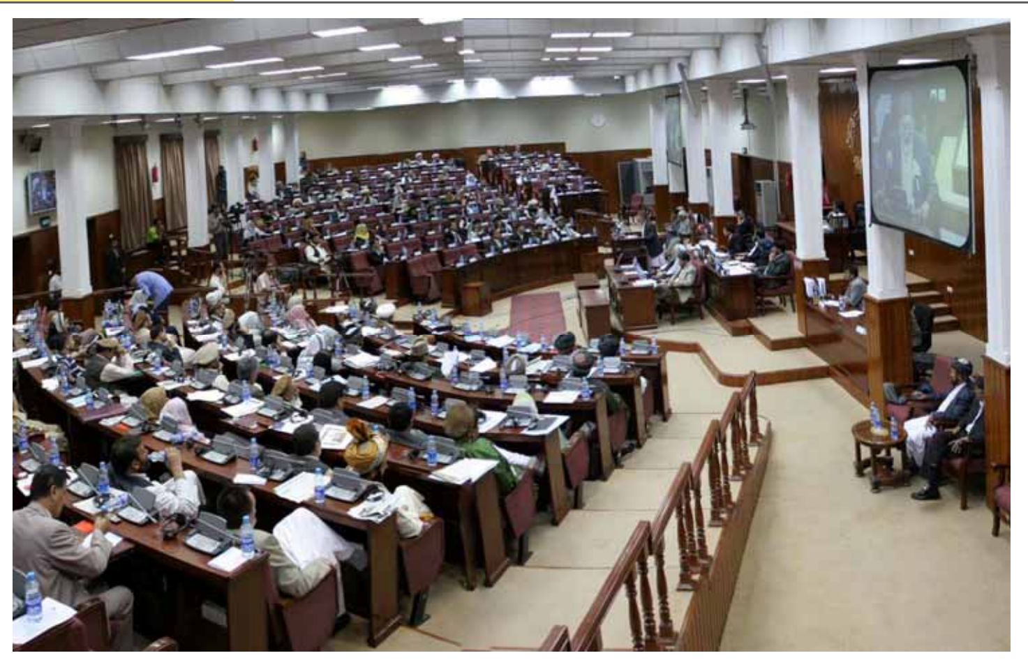
Even factors such as seating arrangements have come to significantly alter gender relations and the decision-making environment in parliament.