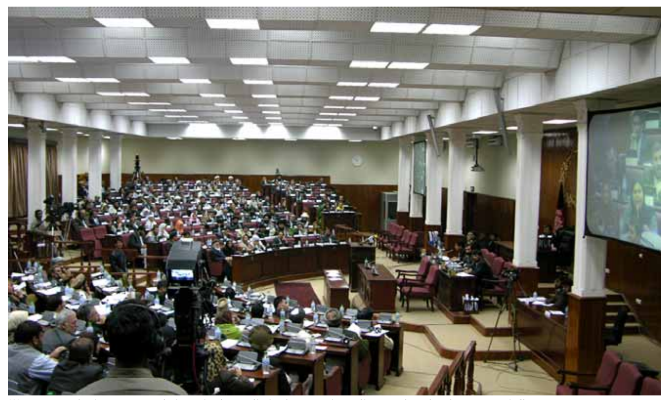
Women's gender interests are being raised, to a limited extent, in parliament, but they have yet to influence

One of the principal concerns of female MPs is women's highly contained presence in the executive. Women's executive presence is not only limited, but limited to stereotypically "women's" spaces. Accordingly, there is currently only one female minister—the Minister of Women's Affairs. This minimal and restricted representation is criticised by the majority of female (and some male) MPs interviewed, and is a gender interest on which