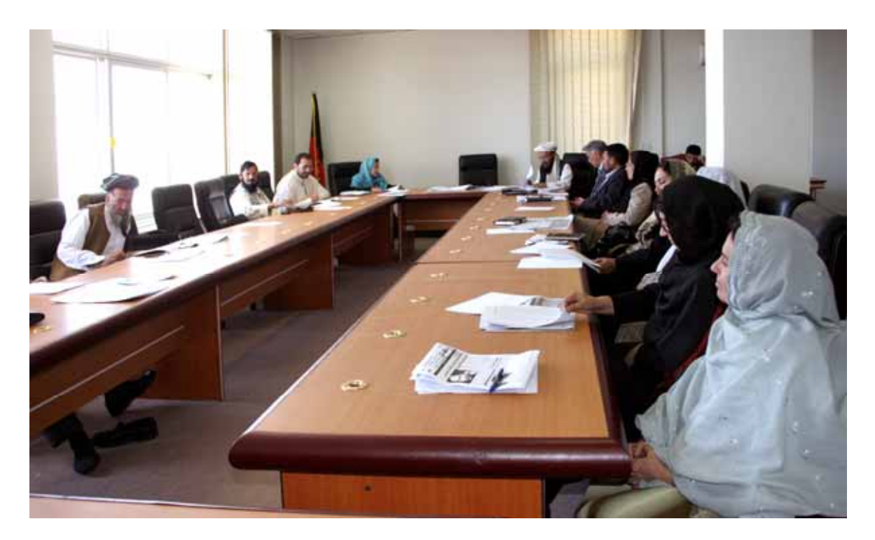
During the first year in parliament 18 commissions were formed to correspond with and monitor the executive ministries. At the time of writing, three of the 18 commission leaders are women.