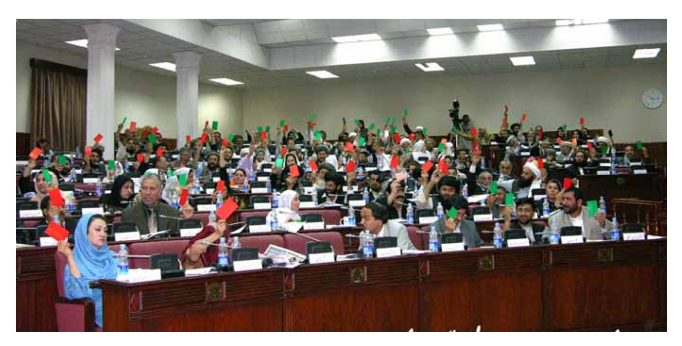
Women's motivations for coming to parliament included the desire to alter a perceived inequity in family dynamics.