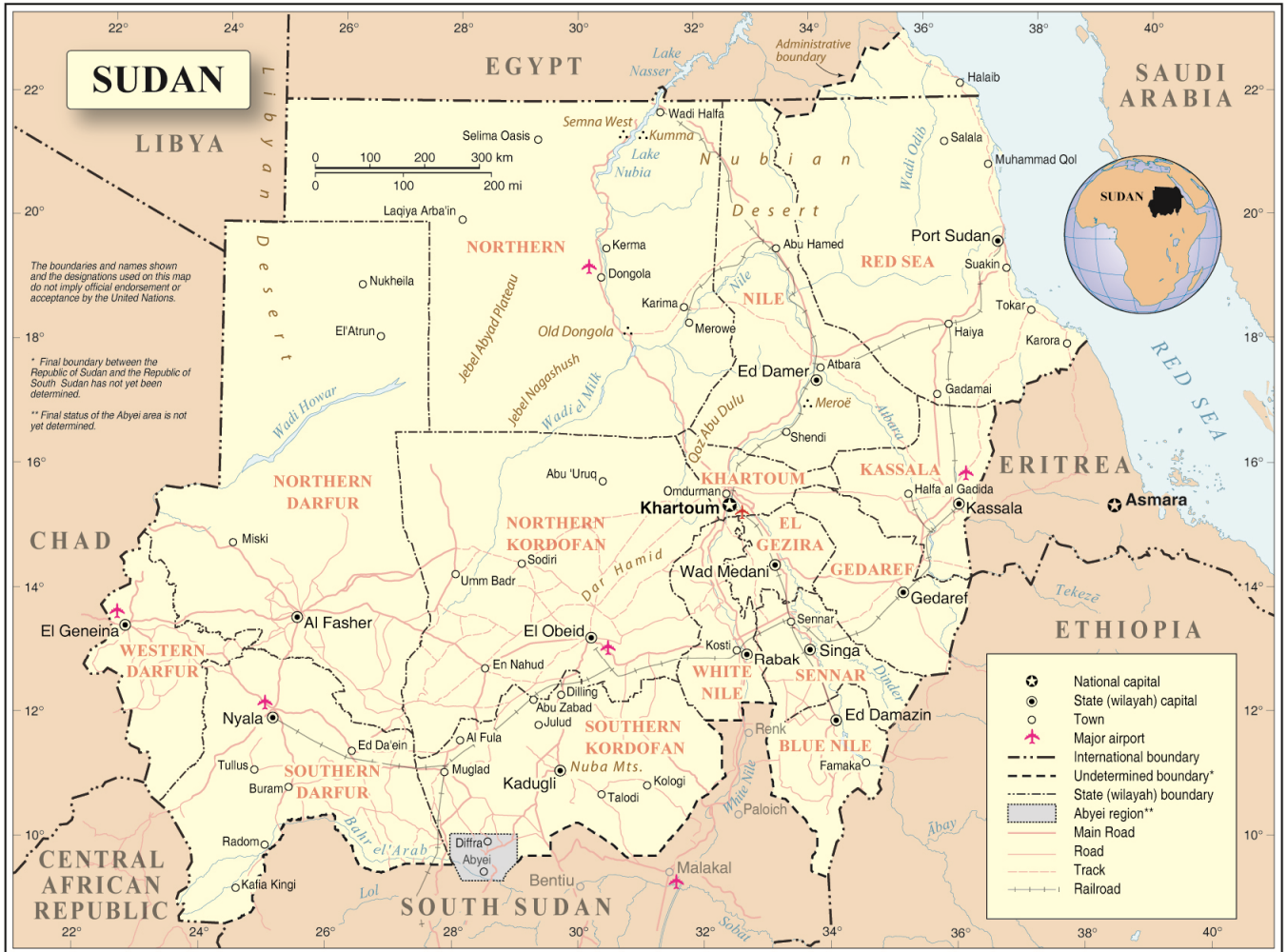
Map No. 4458 Rev.2 UNITED NATIONS March 2012

Department of Field Support Cartographic Section