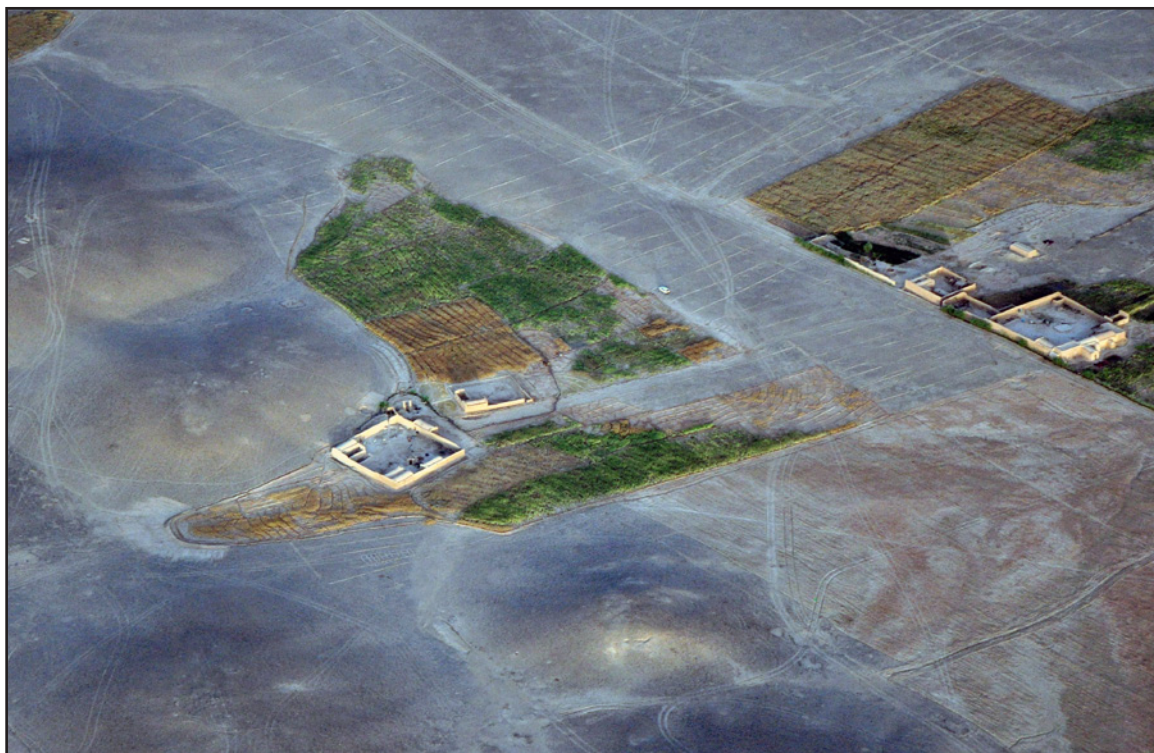
Figure 6: Land under cultivation north of the Boghra Canal

Crop diversity was even more limited for the minority of farmers with five jeribs of agricultural land or less. This group cultivated no wheat, and devoted their entire land to opium poppy. With such small landholdings, these households could not achieve self-sufficiency in food and had to rely on the sale of their opium crop to buy wheat from the bazaar along with other goods and services. Aerial photography suggests that some of these smaller landholders had prepared further land for production but had not yet brought it under cultivation (see Figure 7).