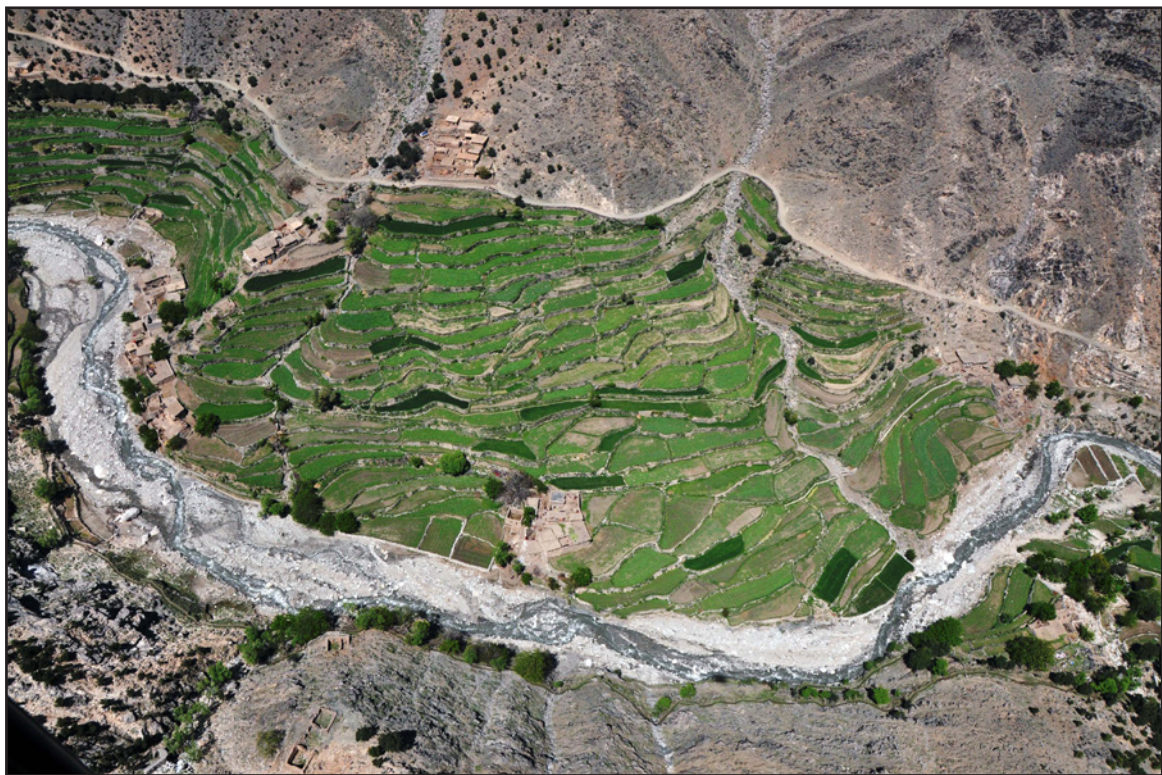
Figure 1: Opium poppy cultivation in the upper Mahmand valley, Achin

While there are isolated patches of opium poppy cultivation in different parts of Achin and Khogiani Districts, cultivation is typically concentrated in those areas “where the asphalt stops.” In Achin, cultivation begins after Asadkhel in the Mahmand valley; in Khogiani, cultivation is found four to five kilometres after Wazir Bazaar. In the lower parts of these areas, opium poppy occupies only a small amount of land, perhaps 25 percent of the total cultivated area. Farmers in these more accessible areas are taking small steps as they tentatively resume opium poppy cultivation for the first time in three years.