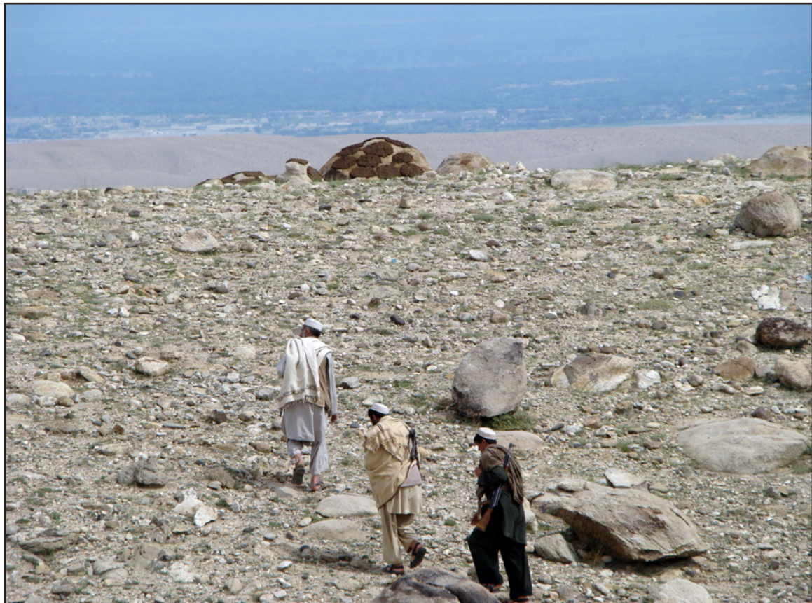
Figure 2: Armed men travelling from Kahi to the disputed area in lower Achin

In contrast to Khogiani, Hisarak and Sherzad, growing opposition to the central government is generally absent in Achin District. Instead, the target of resentment is the governor and the provincial authorities for their perceived role in the ongoing land dispute over the desert that lies between Kahi and Ghani Khel. This feeling is especially bitter among parts of the the Shinwari population, particularly the Mahmandi. Attempts to resolve the dispute date back to February 2010 when the Mahmandi first occupied the land and attempted to build on it. The armed conflict that arose when the Alisherkhel attempted to prevent the construction of houses on what they see as their land has since led to a number of deaths and injuries.