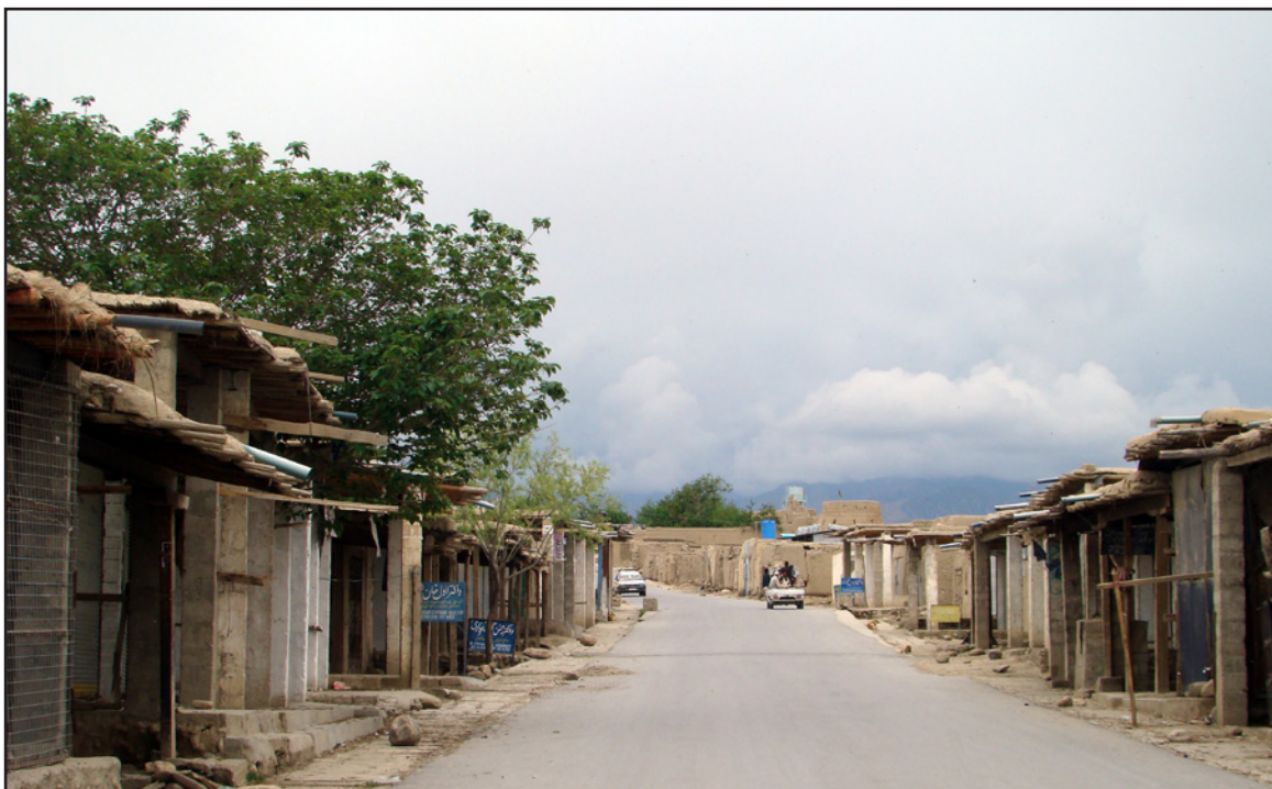
Figure 3: Kahi Bazaar, Achin, April 2011

The two communities involved in the dispute are incurring significant costs as a result of the conflict. For example, Mahmandi respondents reported that every male over the age of 16 is required to spend 20 days guarding the desert land—time that could be spent working elsewhere. Those that cannot undertake this duty for any reason are required to pay someone else to take their place. This will typically cost around 20,000 Pakistani Rupees (US$235) 33 for the 20-day period. The costs of weapons (60,000-80,000 PR for an AK47) and the bullets are also borne by the household, as are food costs incurred during guard duty. At the time of fieldwork, Kahi Bazaar was closed; situated in a Mahmandi area, Alisherkhel shopkeepers were afraid to work, fearful that they might be injured or held hostage. The high school in the bazaar was also closed and many Alisherkhel women and children had reportedly left the area to avoid being caught up in the armed conflict. It was also alleged that both the Alisherkhel and the Mahmandi were holding a number of individuals from the opposing tribe captive. The Mahmandi also complained that they have to avoid travelling along certain roads for fear of being fired at or “arrested” by the Alisherkhel.