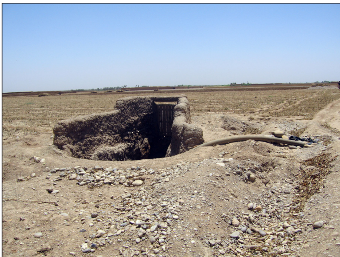
Figure 5: Tubewell, Helmand Province

The process of migration for those purchasing land north of the Boghra Canal appears to follow a fairly common pattern. The vast majority of those interviewed (95 percent) had previously lived south of the canal, typically working under a sharecropping arrangement on someone else's land. Most were drawn to the area by the opportunity to own land and build a house—seen as unaffordable in the canal command area. A number of respondents also complained that increasing insecurity south of the canal—particularly during the 2008 and 2009 military operations in Nad-i-Ali District—had also led them to relocate northward. Complaints of corruption and intimidation by government officials and a failure to deliver development assistance were also cited as push factors leading to migration.