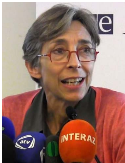
Tana de Zulueta (Italy) Head of the OSCE/ODIHR delegation