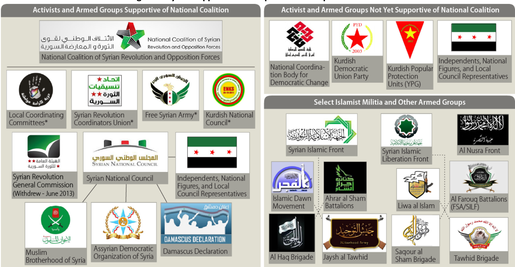
Figure 2. Syrian Opposition Groups: Relationships and Factions

* Many of the groups that supported the creation of the National Coalition of Syrian Revolution and Opposition Forces have diverse memberships of local activists, factions, and brigades. These actors may hold differing views of the National Coalition and its decisions. The Kurdish National Council (KNC) reportedly offered conditional support for the Coalition if several political issues, including Kurdish representation in the Coalition and rights in a future Syria, would be addressed. The KNC was allocated membership in the Coalition, but its support is still being determined. Coalition leaders reportedly have deferred decisions regarding the constitutional issues raised by the KNC until a democratically elected government has been formed.