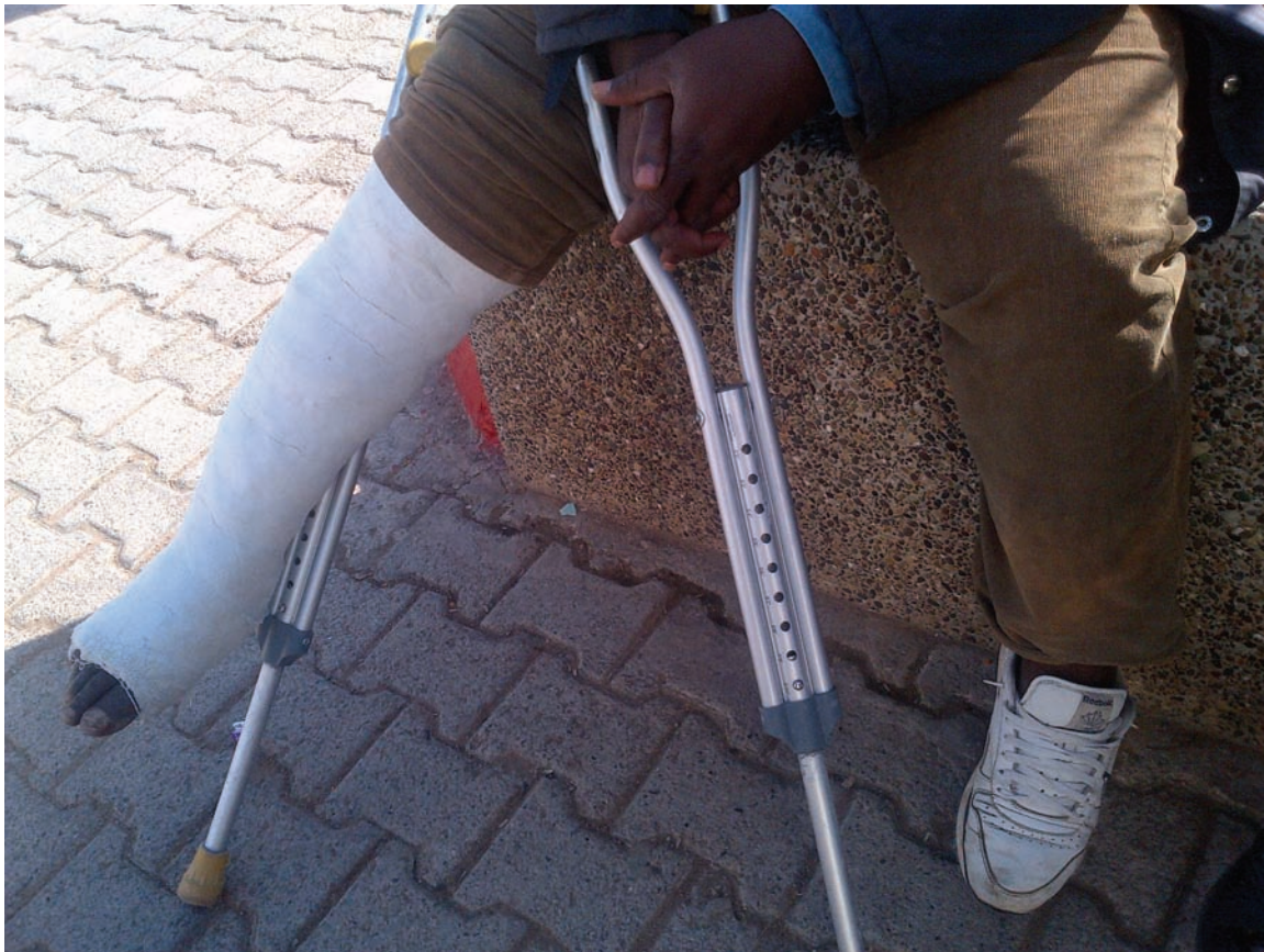
A migrant from Chad at El Hassani hospital in Nador who told Human Rights Watch that Moroccan security forces broke his leg by hitting him with a rod.

Gourougou rising on the Moroccan side of the fence. The second enclave, Ceuta, has two fences and a similar infrastructure.