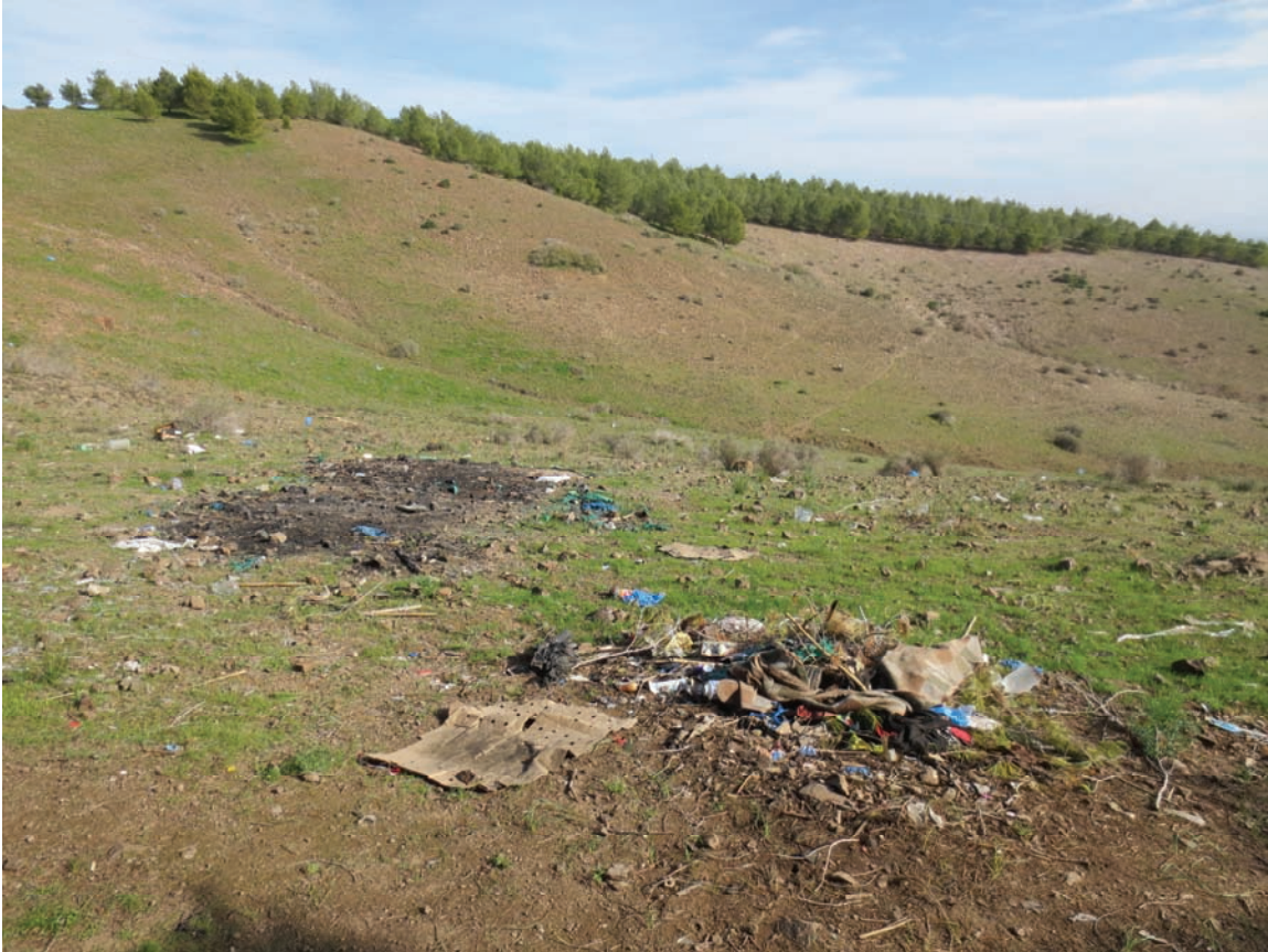
Two tents destroyed by Moroccan security forces at an unofficial migrant camp outside of Selouane, near Nador. © 2012 Human Rights Watch

Human Rights Watch observed the remains of several makeshift shelters and piles of belongings that had been destroyed by fire. Migrants told Human Rights Watch that the police had burned the shelters and belongings.