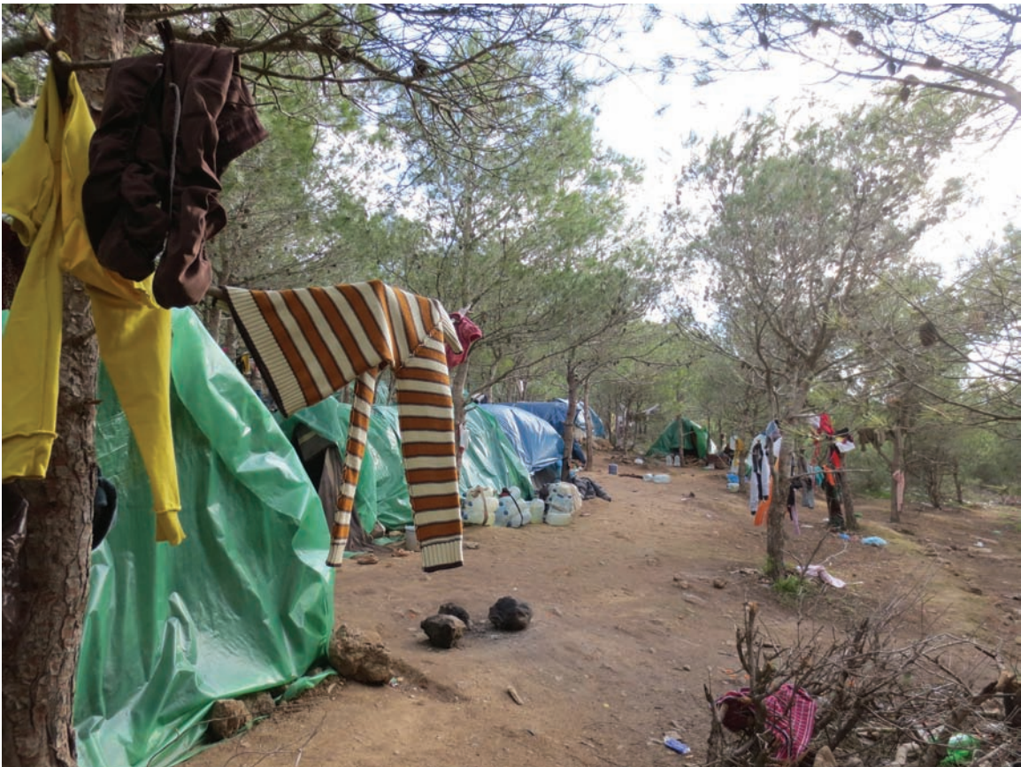
An unofficial migrant camp outside of the town of Nador.

In all of these sites that Human Rights Watch visited, migrants live in tents improvised from sticks, branches, and plastic tarps. The makeshift shelters are often cramped, housing several families or large groups of unrelated individuals.