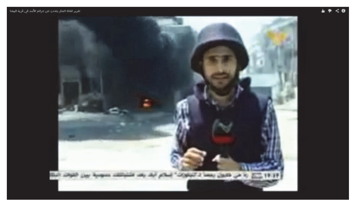
Screenshot from footage broadcast on May 3 by the Hezbollah TV station al-Manar that shows active fires in al-Bayda's main square. 82