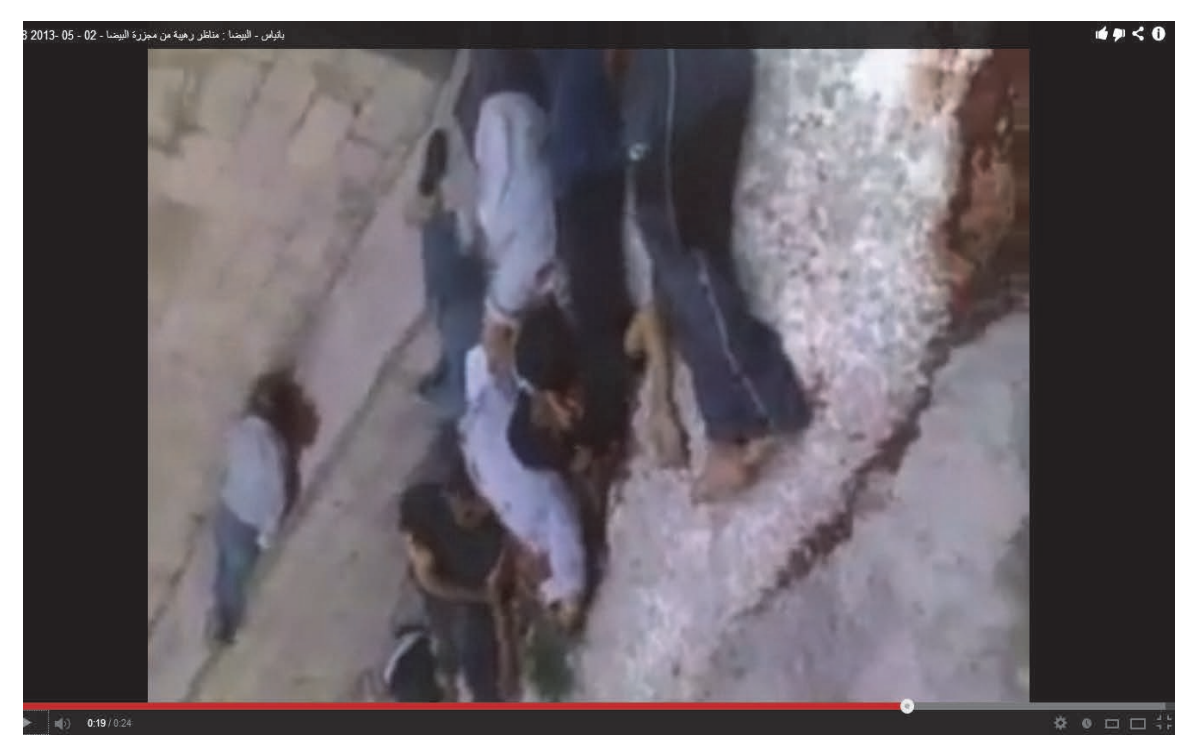
Screenshot from footage filmed on the afternoon of May 2 of Tal'et Abboud.38

Footage filmed by Mohammad and Majed that afternoon shows at least a dozen bodies lying on the ground on the road that local residents confirmed is the one they refer to as Tal`et Abboud.<sup>37</sup>