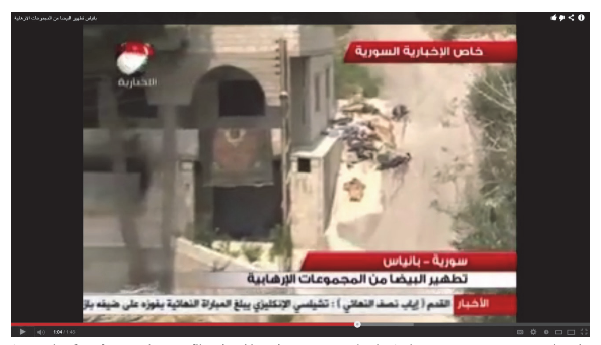
Screenshot from footage that was filmed and broadcast on May 3 by the Syrian pro-government TV station al-Akhbariya shows the bodies of members of the Bayasi family<sup>39</sup>

Blood traces on the available video footage suggest that the men had been executed near the location where they were found.