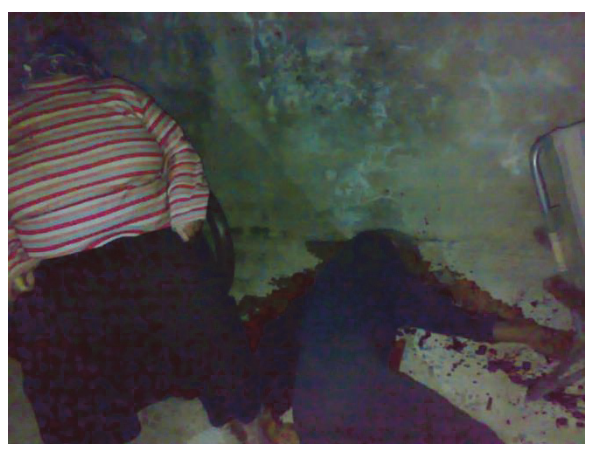
Photo showing wife of Sheikh Omar al-Bayasi and her son Hamzeh.

Human Rights Watch reviewed photos taken by local residents after the pro-