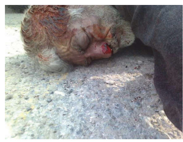
Photo of Sheikh Omar al-Bayasi following his execution.

Sheikh Omar had fallen forward. He too was shot in the head. The three of them were shot in the head. They were sitting in chairs next to each other and the three of them were dead.<sup>66</sup>