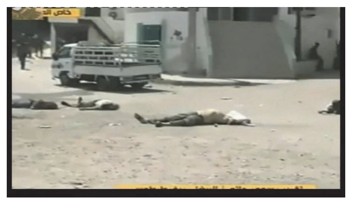
Screenshot from footage from al-Manar TV channel that aired on May 2 shows corpses lying in the main village square of al-Bayda.<sup>54</sup>

Local activists also shared with Human Rights Watch video footage that shows government or pro-government forces piling up bodies inside a shop that local residents identified as the Azzam cell phone shop. The footage was likely filmed by pro-government forces and eventually obtained by someone who posted it on YouTube.55 The footage shows men in military outfits dragging bodies to the shop. Blood traces at the entrance of the shop indicate that the bodies had been dragged there. There are three bodies just outside the shop and at least 25 inside. Many had a bloodstain on their clothes indicating where they had been shot.56