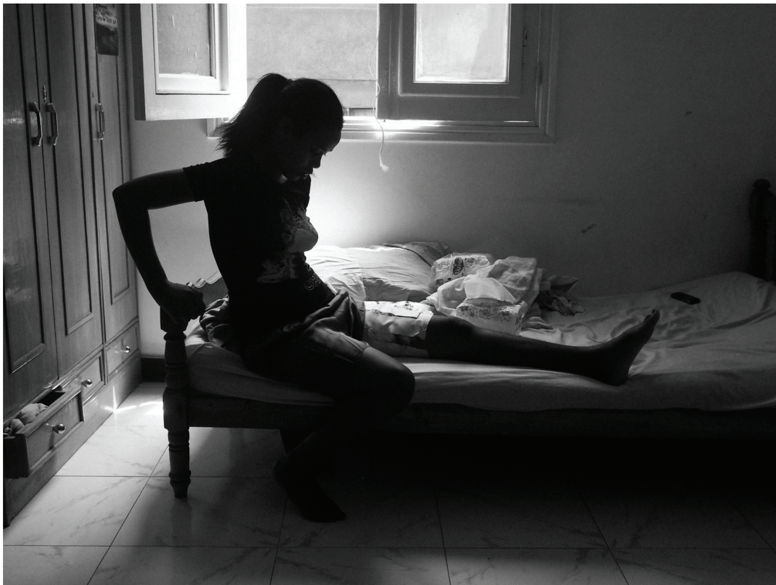
An Eritrean trafficking victim recovers from skin transplant surgery in Cairo, Egypt after traffickers in Sinai chained her ankles causing a severe infection. Trafficking victims have described to Human Rights Watch and other NGOs how traffickers chained them—often to one another—for months on end, while abusing them, including by raping women in front of other trafficking victims.