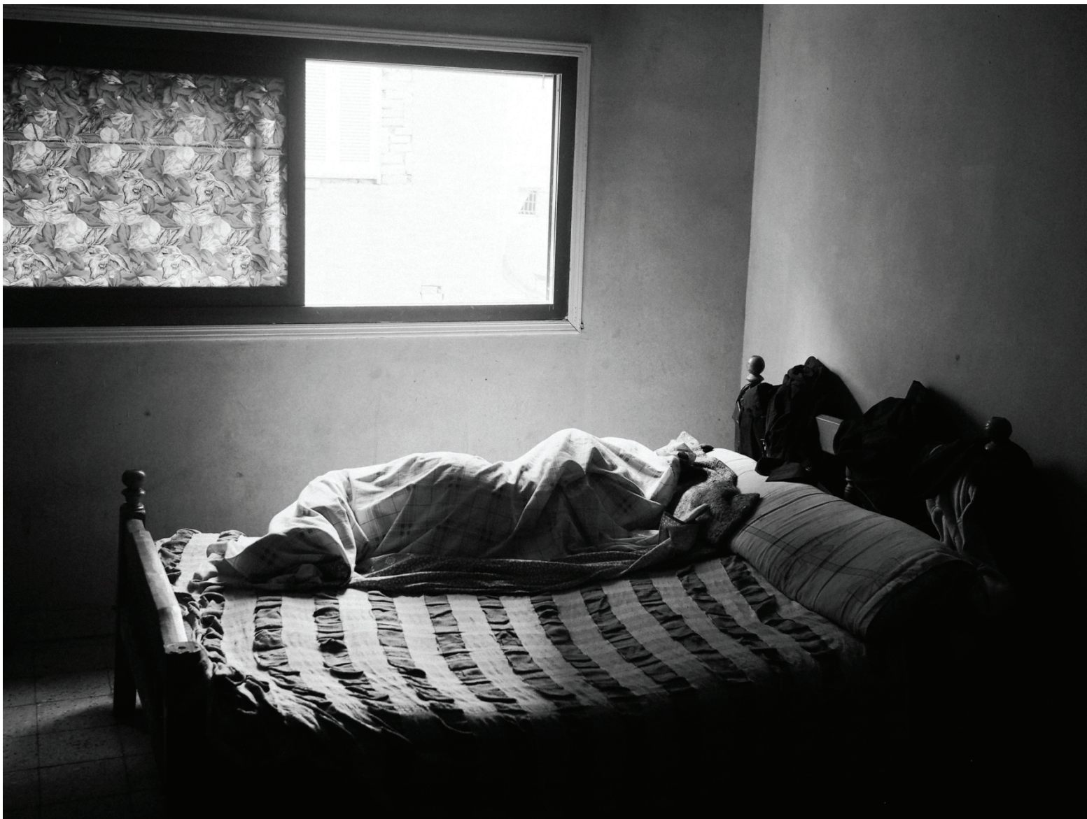
An Eritrean trafficking victim sleeps at a safe house in Cairo, Egypt on May 2, 2013. Some trafficking victims who escape from or are released by their captors in Sinai find their way to Bedouin community leaders who help them travel to Cairo where various NGOs help them.