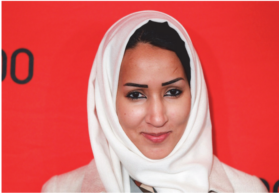
Manal al-Sharif.

The Saudi Ministry of Interior does not issue driving licenses to women, making it effectively illegal for them to drive. Even in cases where women have international driving licenses, police have arrested or reprimanded them, or forced their male guardians to sign pledges that they would not drive again. Saudi Arabia's ban on women drivers has forced women to rely on male relatives and privately-hired chauffeurs to conduct such basic tasks as running errands or going to work. Women have complained that hiring drivers is costly. The authorities have not sought to enforce the ban on women driving in some rural areas, where it is practiced outside their purview. 45