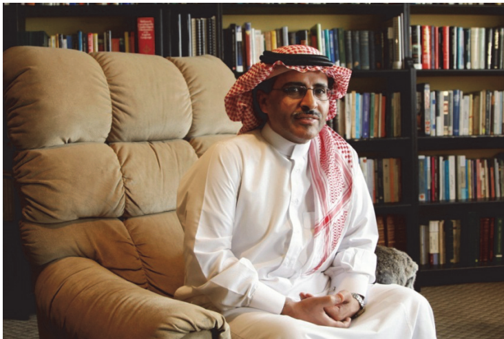
Mohammed al-Qahtani.

In April 2012, al-Qahtani, al-Hamid, and a group of other reformists signed a petition calling for Prince Nayef to be removed as Crown Prince because he was "not fit to be the next king." 87 The petition claimed there had been ill-treatment of tens of thousands of detainees during Prince Nayef's tenure as Minister of Interior when he had helped to turn the Mabahith police into a "henchman to terrorize the people." 88