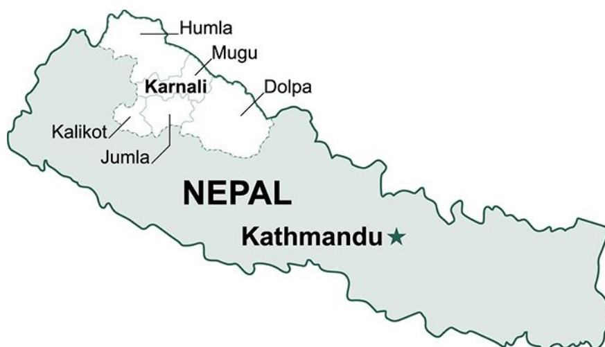
Figure 5: Karnali region, Nepal

Social protection has become an increasingly prominent public policy tool in Nepal over the past two decades and has a wide range of objectives, from increasing income and food security to overcoming social exclusion and assisting with the process of political healing (Koehler, 2011). The Nepal case study considered the Child Grant – launched by the government of Nepal in 2009. The Child Grant is a cash transfer for mothers with children under the age of five, aimed at improving the nutrition of children. It is universal in Karnali and targeted at Dalit households in the rest of the country. In 2012/13, it covered 551,916 children in Nepal (approximately 21.5% of the population of children aged less than five), with 90,349 of these being from Karnali.