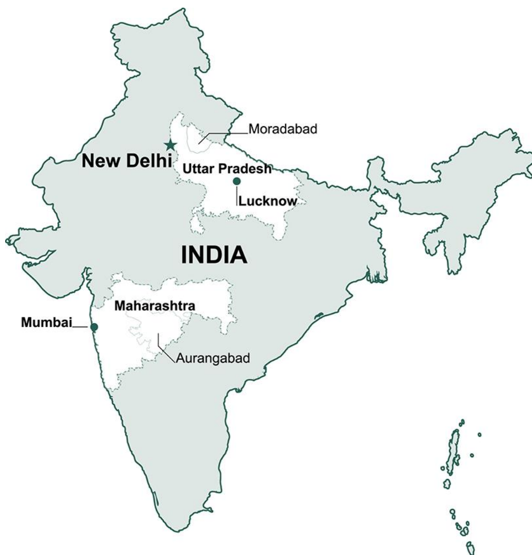
Figure 4: Maharashtra and Uttar Pradesh states, India

The list of eligible beneficiaries in each village is posted on the village notice board a few days before the date of enrolment and the health insurance company sets up enrolment camps in villages. A biometric smart card is given to each household after payment of the registration fee; households have to renew their smart cards every year. During enrolment, the insurance company also provides a list of empanelled hospitals 7 to each beneficiary household from where they can obtain health care facilities under the scheme. Payment for health care is cashless: it is done through the smart card then reimbursed to the empanelled hospitals by the insurance company. Beneficiaries are provided inpatient treatment for around 700 types of health problems. Pre-existing health conditions and pre- and post-hospitalisation expenses are also covered. Households are also entitled to