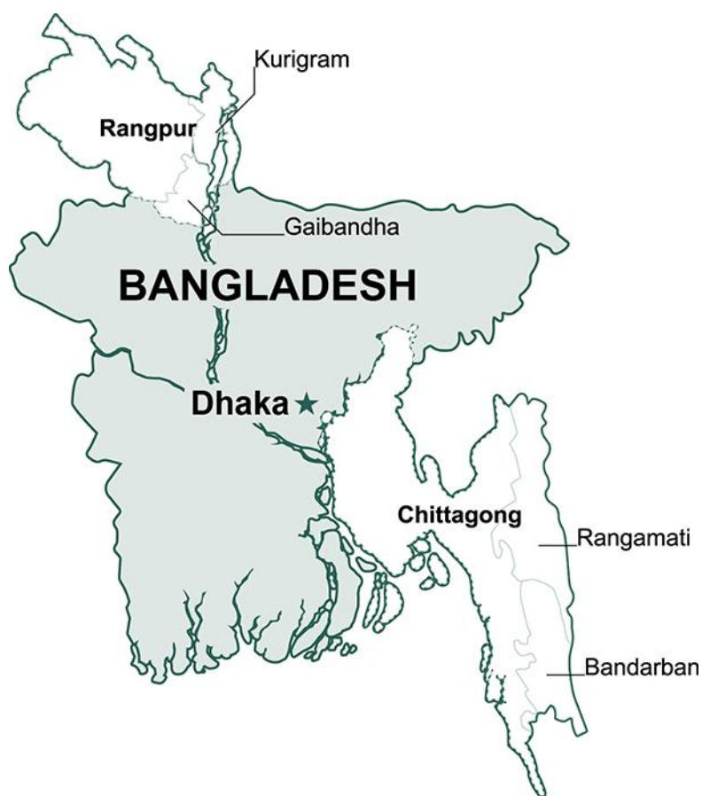
Figure 3: Chars and the Chittagong Hill Tracts, Bangladesh

This case study looks at the effect of two social protection programmes on reducing deprivation and promoting social inclusion: the donor-funded Chars Livelihoods Programme (CLP) – an asset transfer programme targeted at poor women that combines an integrated economic and social empowerment approach; and in CHT the Vulnerable Group Development (VGD) programme, run by the government and the World Food Programme (WFP), which provides a food transfer coupled with economic and social development training to poor women. CLP in the Chars and the VGD programme have similar objectives but different approaches; this study did not aim to compare them, but rather looked at each programme's contribution to reducing social exclusion.