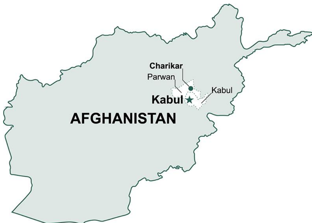
Figure 2: Karbul and Parwan provinces, Afghanistan

ARC participants had the opportunity to receive two types of training, on life skills and on livelihoods. The life skills education training was a five-day course discussing general and reproductive health and children's and women's rights. The livelihoods training was taught for three months and offered skills intended to allow the participants to undertake income-generating activities and become economically reliant.