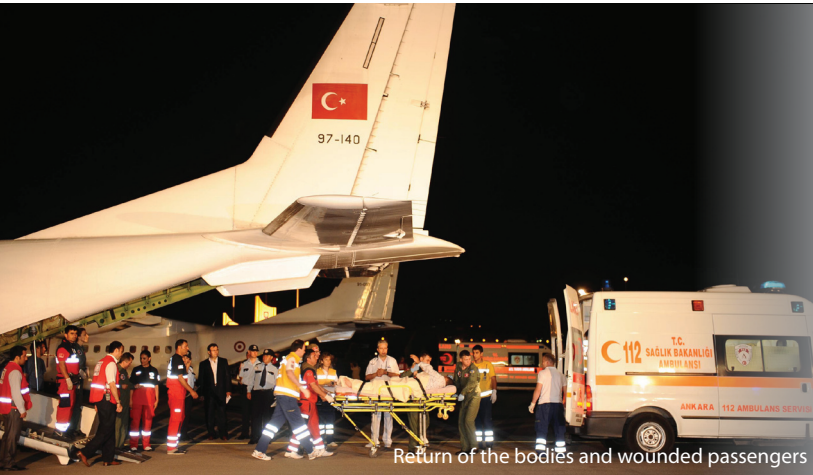
Return of the bodies and wounded passengers

Since the early 2000's, Turkey's newly adopted vision for the Middle East, which targets political stability and economic integration in the region, started to openly clash with Israeli vision of the region that is characterized by isolation, fragmentation, and the sacrifice of international law for security concerns. The clashing visions for the region have put the two countries in a position where diplomatic crises are almost unavoidable. The latest flotilla attack or the previous chair crisis are merely the tip of the iceberg and are reflective of the two states' divergent regional outlook and understanding of a lasting peace.