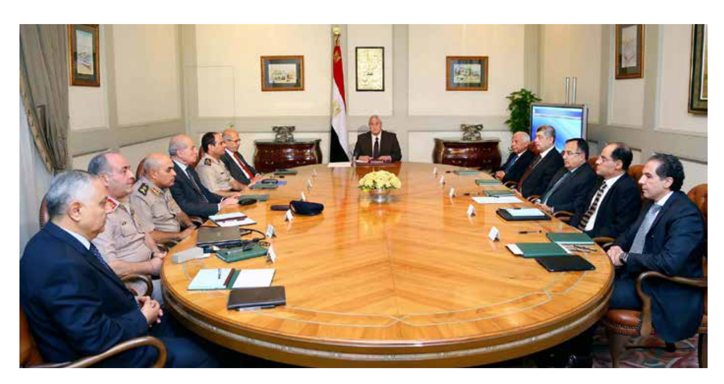
Egypt's National Defense Council (NDC), chaired by Interim President Adly Mansour and consisting of leading civilian and security officials, meets in July 2013. On August 4, the NDC formally reviewed and approved the plan to disperse the Rab'a and al-Nahda sit-ins drafted by the Interior Ministry. According to security sources, the plan anticipated several thousand casualties. On August 15, the day after the dispersal, Interior Minister Mohamed Ibrahim told Al-Masry al-Youm that "the dispersal plan succeeded 100 percent."

Muslim Brotherhood leaders and the government took place throughout July and the beginning of August until Prime Minister Hazem al-Beblawy announced their failure on August 7. The Interior Ministry, which had already drawn up a dispersal plan that had been approved by the National Defense Council and the cabinet and had received authorization to disperse from the Public Prosecutor based on citizen complaints that had been submitted, announced that it would proceed with dispersing the sit-ins. However, for weeks security officials promised that the dispersal would be gradual, starting with a cordon around the sit-in, warnings and a safe exit, in particular for women and children. None of the promised precautions, however, were taken.