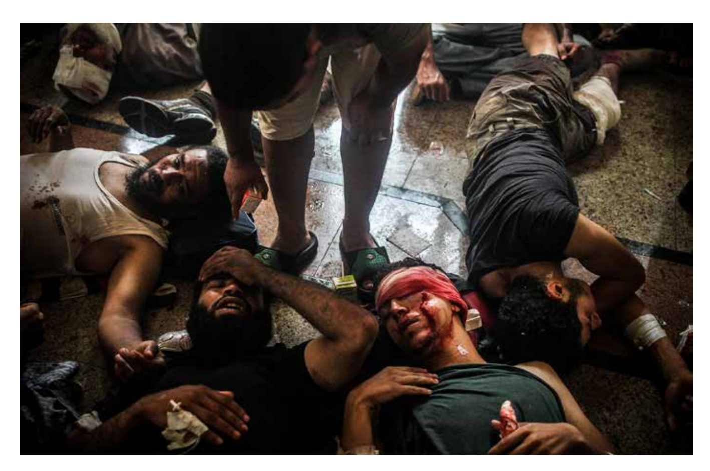
Injured protesters rest in a makeshift field hospital in Rab'a Square, where overwhelmed volunteer doctors tended to the hundreds of injured and dead protesters in the midst of August 14 dispersal of the Rab'a sit-in. Security forces besieged protesters for nearly 12 hours without safe exit, including for injured protesters in need of medical attention.

Rab'a dispersal that, "I am not saying everyone was firing, but it is more than enough if there are 20, 30, or 50 people firing live fire in a sit-in of that size." If the figure of 15 guns is an accurate representation of the number of protester firearms in the square, it would indicate that few protesters were armed and further corroborates extensive evidence compiled by Human Rights Watch that police gunned down hundreds of unarmed demonstrators.