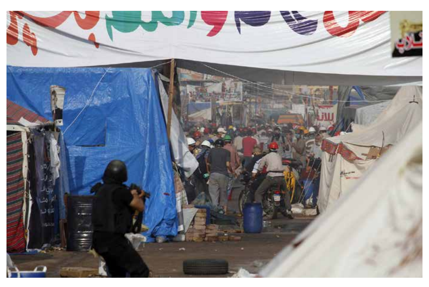
forces killed between 400-800 protesters largely over a 24-hour span during the Tiananmen Massacre on June 3-4, 1989 and that Uzbek forces killed roughly similar numbers in one day during the 2005 Andijan Massacre.

The indiscriminate and deliberate use of lethal force resulted in one of the world's largest killings of demonstrators in a single day in recent history. By way of contrast, credible estimates indicate that Chinese government