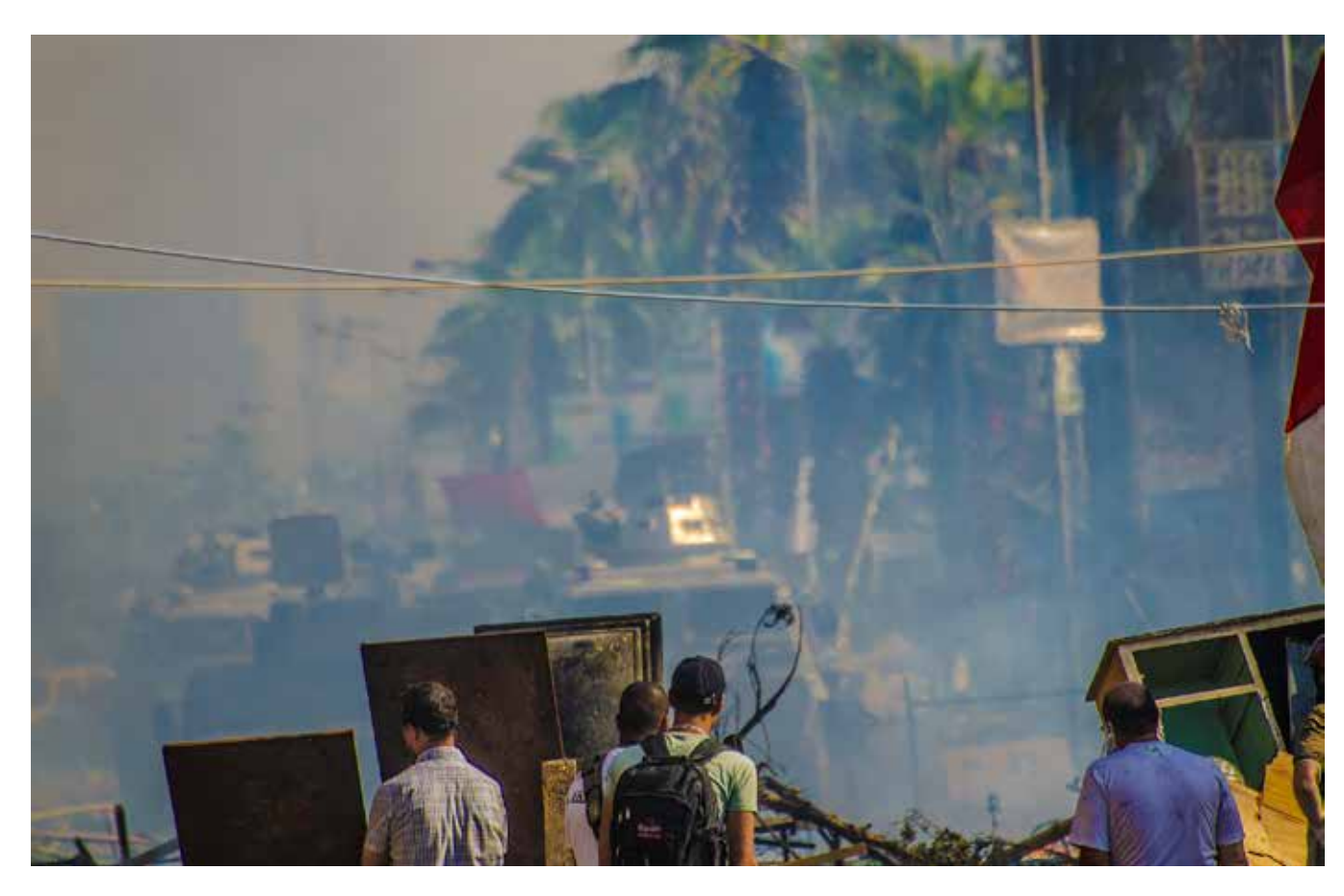
Armed personnel carriers (APCs) operated by the Egyptian police approach protesters assembled behind makeshift fences in Rab'a al-Adawiya Square in eastern Cairo on August 14, 2013.

protest encampment, where demonstrators, including women and children, had been camped out for over 45 days, and opened fire on the protesters, killing at least 817 and likely more than 1,000.