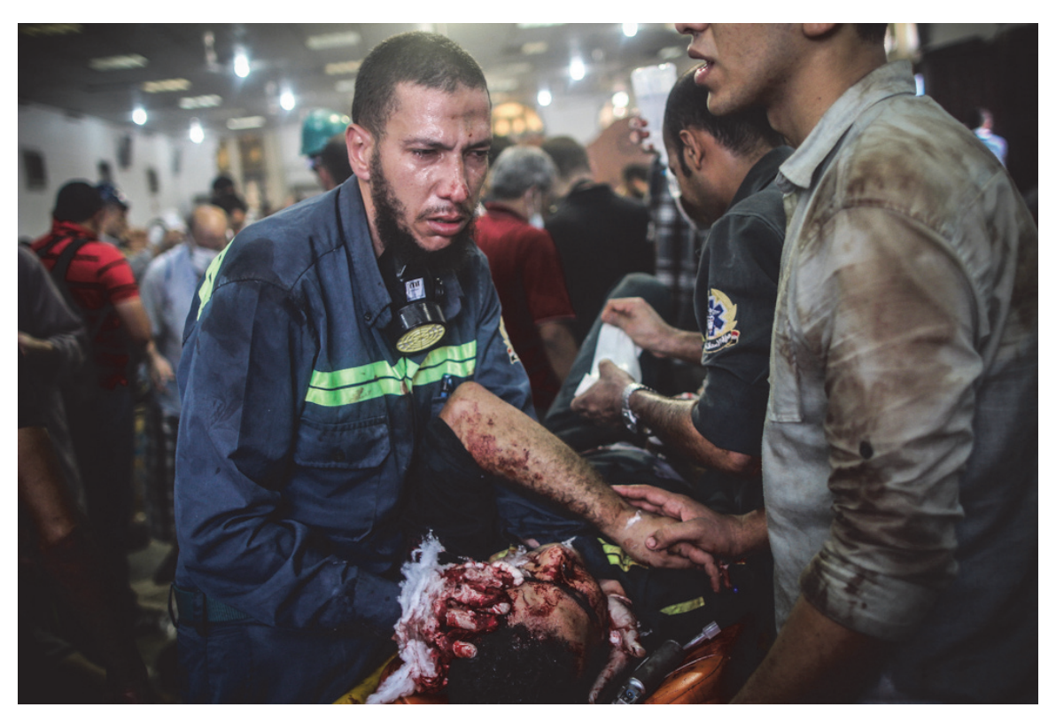
An injured ambulance worker surrounded by colleagues in the Rab'a field hospital on August 14, 2013 after getting shot while trying to reach injured protesters during the dispersal in Rab'a square. He died of his injuries, according to witnesses.

By around 8:30-9 a.m., security forces had arrived near the Traffic Directorate building on Nasr Street and teargas, birdshot, and live fire began to reach the field hospital, just meters away. Doctors instructed volunteers and the injured to move away from windows, as pellets and bullets came through. A volunteer pharmacy student, who helped doctors on the day of the dispersal, told Human Rights Watch: