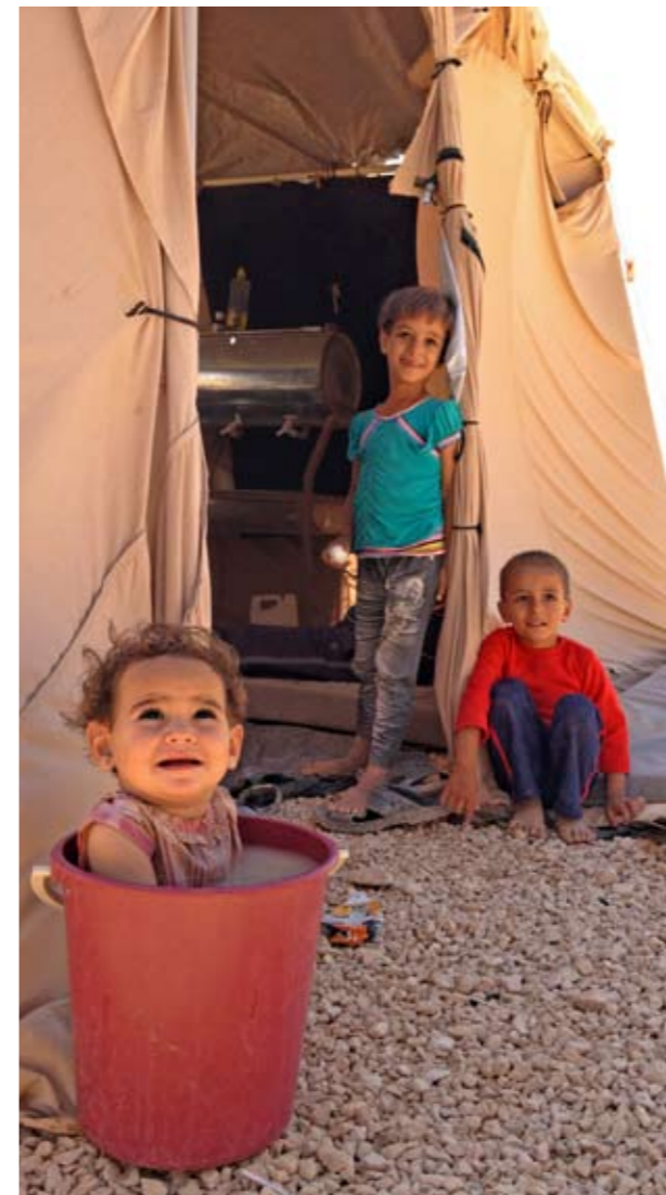
In Zaatari, over 800 children have registered to enter Jordanian schools, under an on-going registration effort. More than 4,500 children have also received vaccinations in a campaign led by UNICEF.

Despite the fact that this rapid assessment exclusively looks at Zaatari camp, it is of critical importance to