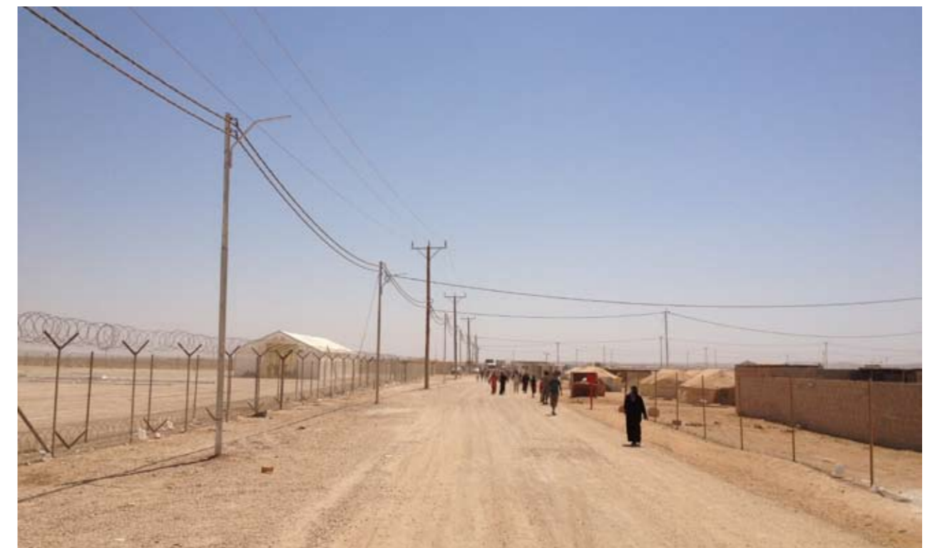
According to the Jordan Times, in response to Amman's "closed camp" policy, Syrian activists and concerned citizens have formed underground "smuggling networks", assisting the flight of Zaatari residents and housing them in a series of so-called safe houses stretching across the northern region. 1 The Interior Ministry policy restricts the movement of refugees within Zaatari, granting only a handful of permits to leave the compounds for "exceptional" cases.

Zaatari's maximum capacity is 80,000 refugees, and with more than 100,000 expected before the end of the year, one or two more camps are expected to be built soon nearby. If humanitarian forecasts prove correct, Zaatari could become the third largest city in Jordan before the end of the year.