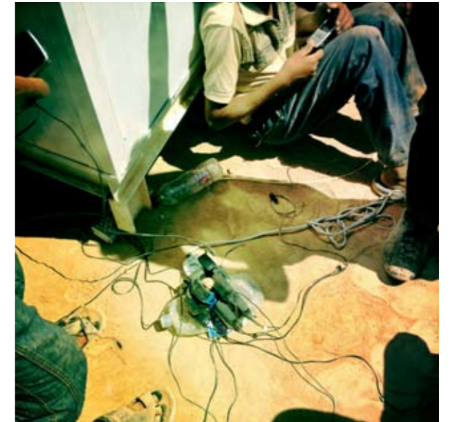
While an important number of refugee families has access to a functioning mobile phone, the lack of electricity and opportunities to charge mobile phones was creating anxiety and frustration among Syrian refugees in Zaatari. In the picture, a group of young boys await for their mobile phones to be charged by the main entrance of the camp in September 6, 2012.

SYRIA REGIONAL REFUGEE RESPONSE - JORDAN, LEBANON, IRAQ, TURKEY, 7 SEPTEMBER 2012