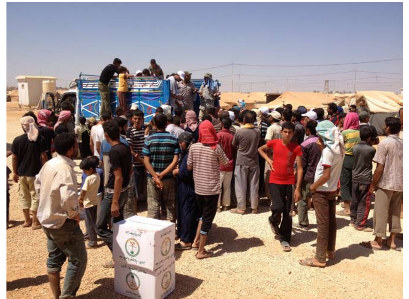
"There is not enough food and water and we are scared to go out in the camp and fetch for ourselves because there are many people looking for them too. Access to services, that's the information we need," affirmed a refugee father of 4 in Zaatari. In the picture, a food distribution takes place. Only men and boys are by the track.

Based on its extensive experience in similar settings, Internews advocates for multi-platform/multi-channel approaches using local media, non-mass media communication channels (e.g. community volunteers), traditional/indigenous channels (e.g. religious leaders), or mobile technology and social media, always based on a good understanding of the