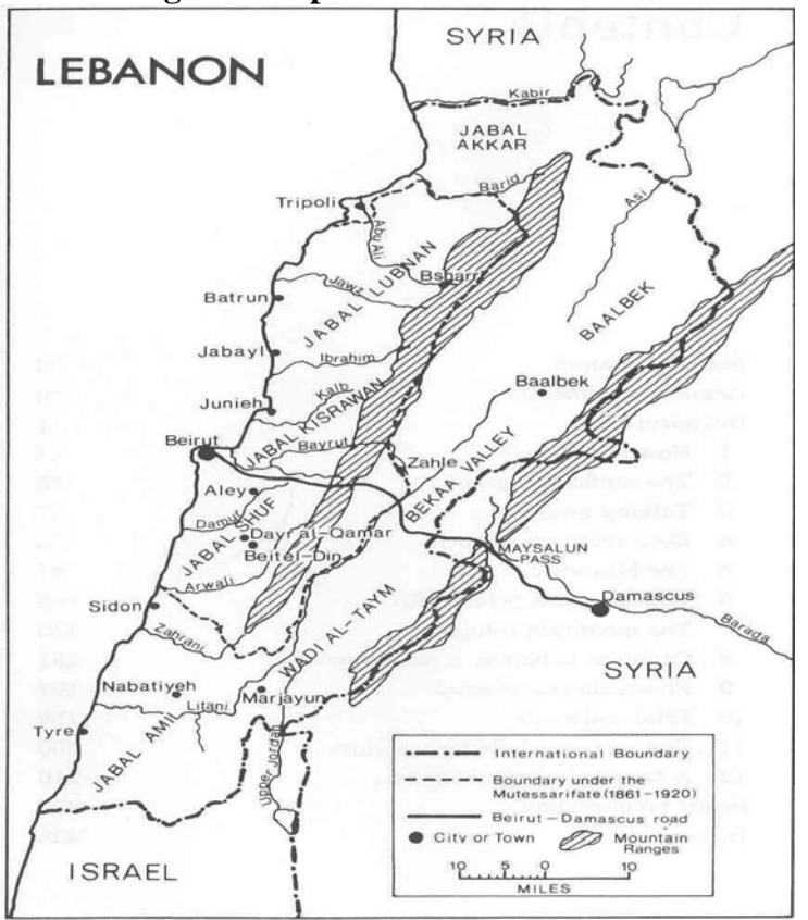
Fig. 1. Map of Lebanon's Borders

This chapter sets out the geography, history, religions, and politics of Lebanon. Lebanon is a small country located on the East coast of the Mediterranean. Syria borders Lebanon to the north and east. Since 1948 Israel borders the south of Lebanon. Originally, Lebanon was a small strip of land consisting of the Lebanon Mountains and coastal areas excluding the bigger coastal cities as can be seen in figure 1 below. This strip of land was also known as the Mutessarifate. The borders of the Mutessarifate were drawn in 1861 by the French during the late Ottoman Empire. In 1920 when France received a mandate over Lebanon these borders were extended into all directions as is also illustrated on the map below. Currently, the territory of Lebanon is approximately four thousand square miles.<sup>1</sup>