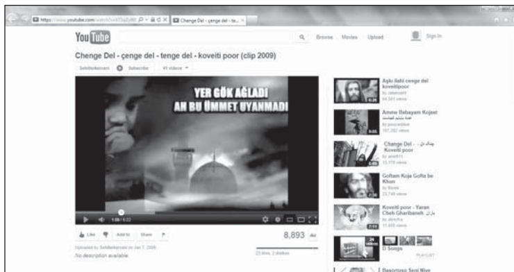
Figure 11. A YouTube video about Palestinian militant groups that uses one of the Persian-language songs affiliated with the Sacred Defense in Iran. The accompanying text is in Turkish and the video was posted by a Turkish user.

A similar dynamic is at work in another item uploaded by a Turkish user who used the same song to accompany images related to Palestine, with a specific focus on Hamas. This clip has a fleeting visual reference to Iran—an image of Ayatollah Khomeini flashes on the screen at the outset—but the remainder focuses on Palestine and all the descriptive texts appear in Turkish. 28 Again, a thematic harmony exists between the song and the images displayed, but this time without irony, since the Iranian state has been open in its support for Hamas. Yet this compatibility and the image of Ayatollah Khomeini flitting across the screen do not constitute meaningful engagement with Iranian state ideologies and thus cannot be read as either clearly disrupting or reinforcing its narratives about the Iran-Iraq war.