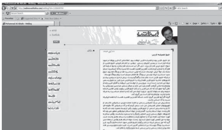
Figure 3. The November 16, 2004, blog post of Mohammad Ali Abtahi, who at the time was vice-president of Iran, in support of Persian Gulf campaigns. Abtahi, a reformist, was a pioneer in embracing digital media and was the first official to start a personal blog.

Abtahi, who was vice-president of Iran at the time, used his personal blog as a vehicle for supporting state and individual efforts to challenge the National Geographic Society. He also proudly credited blogging Iranians as being in the vanguard of activism on the issue. 32