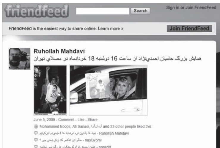
Figure 13. This public Friendfeed post by an Ahmadinejad supporter uses images of trendy youth from a campaign event for Ahmadinejad.

openly carrying signs or symbols associated with the Ahmadinejad campaign. 18 These trends continued after the election; Ahmadinejad supporters shared photos of trendy youth attending pro-Ahmadinejad events and/or carrying placards indicating their sympathy with him or causes he supports. In such cases, the desire to show one's candidate as appealing to diverse groups overrode worries about codes of conduct and dress that concerned many of Ahmadinejad's socially conservative supporters.