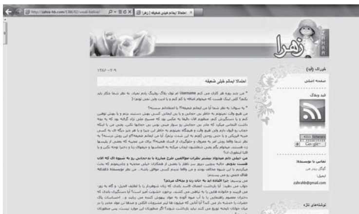
Figure 4. An April 2007 post from the blog Zahra criticizing methods police forces used to enforce dress codes for Iranian women.

Although I believe in hejab , never and under no circumstances could I hurt someone physically or mentally (and to this degree) over something like [the dress code] or anything else. Does that mean that my faith is weak? Or that their way is the right way? Do you really think this is the way to enact amr-e be maroof [the Islamic imperative that Muslims are to guide other Muslims] or to prevent corruption? It is strange to me that some of the police are women. Does their work make them impervious to the cries and the begging of girls and women or is that how they were before? I would really like to hear the views of those who agree with regulating dress codes in accordance to this current method. It might be interesting for you to know that at