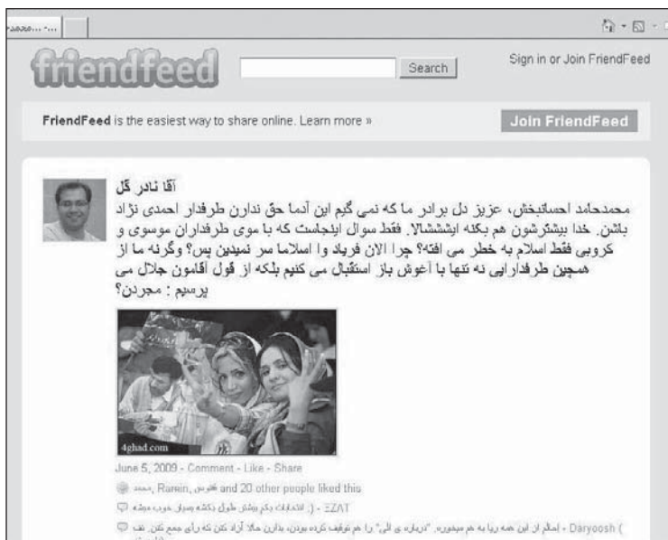
Figure 14. This public Friendfeed post in support of reformist candidates uses a photo circulated by the Ahmadinejad campaign to question the hypocrisy of some of its tactics.

commenting on them in real time and interacting with others who were doing the same. In essence, users transformed Friendfeed into a transnational viewing community where participants from around the world could act as both audience members and debate analysts.