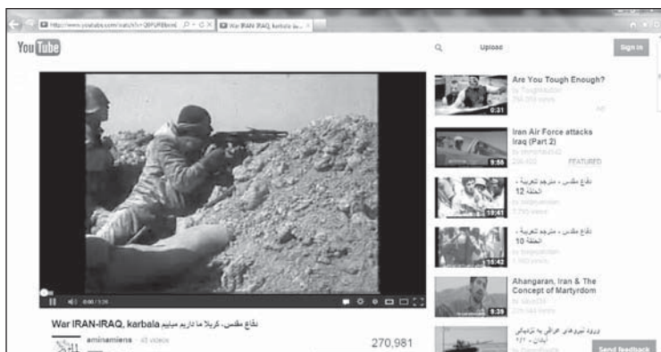
Figure 10. One of the most frequently viewed clips retrieved on YouTube using the Persian search terms for “Sacred Defense.” The audiovisual content was produced with Iranian state support during the Iran-Iraq war and has not been altered by the uploader.