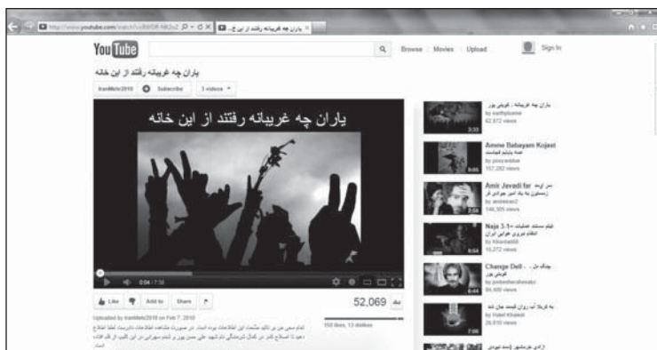
Figure 12. This video's soundtrack uses a Sacred Defense song that is most often affiliated with commemorations of fallen soldiers during the Iran-Iraq War. The YouTube user has repurposed it to commemorate the lives lost in the aftermath of the disputed 2009 election.

reappeared in relation to the post-2009 opposition is Koveitipoor's "Gharibane," a song lamenting the loss of comrades. It was originally composed in remembrance of the Iran-Iraq war dead, and it has had an online life in this capacity; popular video clips mix the song with various scenes from the war. 30 Yet the song has also resurfaced in relation to those who were killed in the aftermath of the 2009 election, and several videos used the song as a tribute to the fallen. 31