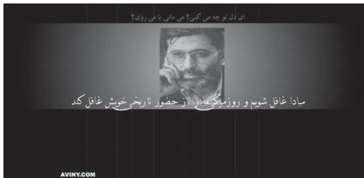
Figure 8. A 2003 screen capture of the introduction page of the Aviny Institute's Web site, one of the most well developed in Iran at the time. The site included audio and flash animation.

martyrdom” have established Web sites to memorialize the war. The Secretariat for the Coordination and Oversight of the Promotion of the Culture of Sacrifice and Martyrdom has been online since 2003. In June of that year, the site put out a call for contributions from readers, promising “valuable prizes” for the best articles. Throughout 2003, the secretariat elicited reader participation, including putting out a call that year and in subsequent years for readers who were willing to serve as official reporters. 7 According to the title of the bylaws that established the secretariat, its mission also includes “upholding the memory of martyrs and celebrating those who sacrificed for the Sacred Defense and providing cultural-artistic facilities for the honored families of martyrs and those who have sacrificed.” 8 Given this mandate, the site primarily functions to highlight news about activities that honor or support war veterans and martyrs. Similar to the Aviny Institute but on a smaller scale, the secretariat’s Web site includes war-related images that can be easily downloaded and recirculated.