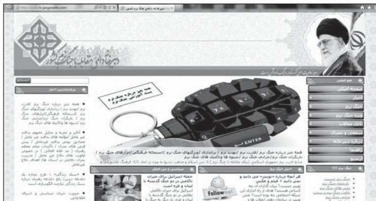
Figure 15. The Web site of Iran’s Secretariat for Confronting Soft War.

Another clear indication that knowledge production about the soft war is understood to be a core component of combating and engaging in soft war can be seen on the Web site Jang-e Narm: