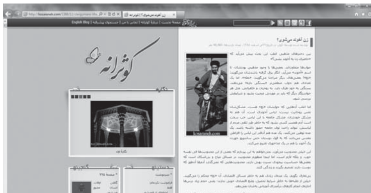
Figure 6. A screen capture of “Would You Marry a Cleric?,” one of the most frequently read posts on the blog of female seminary student Kowsar. The March 13, 2010, post considers the responses of religious women to the question.