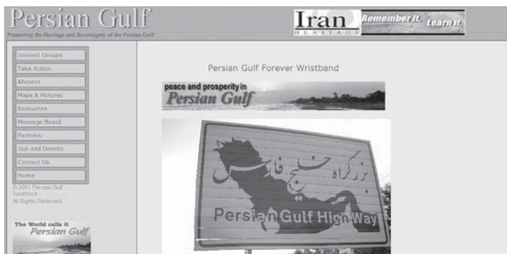
Figure 1. A screen capture taken in 2007 from the main page of the Web site of the Persian Gulf Task Force. The organization has had an online presence since at least 2001. It was formerly available at http://www.persiangufonline.org/ and until fall of 2012 was available at http://persianguftaskforce.org/ .

becomes a central problem in other cases involving the Iranian Internet that bear more directly on local and global political developments.