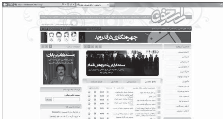
Figure 9. The Web site Rasekhoon offers audio and audiovisual content on the topic of “Sacred Defense” for streaming and download. The site also contains prominent ads that link to political documentaries about Iran’s former king and the Mujahedin-e Khalq organization.

In addition, hundreds of blogs are solely devoted to the war. Many of these began in 2004. It is likely no accident that this is the year that the number of published memoirs and fictional accounts related to the eight-year conflict spiked. While these blogs are ostensibly independent, they must be read both in relation to the explosion of offline content and state-supported production of material online. 13 Discussions of the war and its legacy are also evident on blogs that are not expressly devoted to the issue. These have been largely produced by those who self-identify as religious and who often express allegiance to the ruling system. However, this positionality does not always translate into an affinity with government-favored narratives; these bloggers have offered some of the most biting critiques of the conflict’s legacy, especially the current situation of veterans (Akhavan 2011). Whatever their particular take on the conflict, the countless blogs that are devoted to the war open new forums for virtual content production and circulation, including audiovisual content. 14