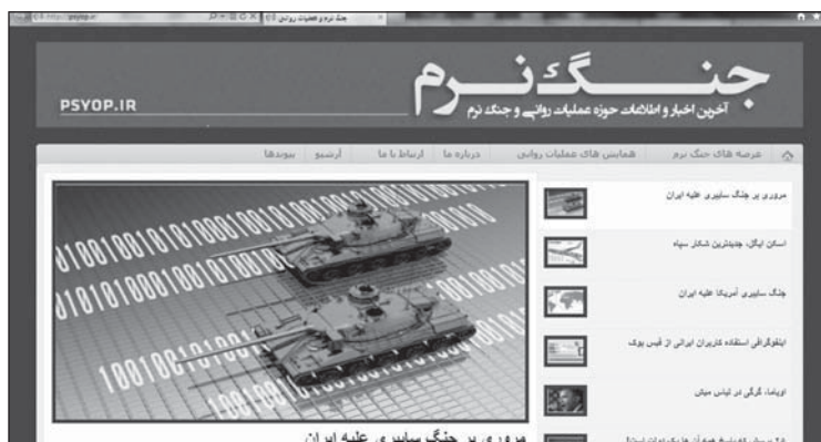
Figure 16. The Soft War Web site, whose URL is the perhaps telling psyop.ir.

Jang-e Narm emphasizes that new strategies are being used against Iran that require new responses. A November 2011 piece on the site covering Ayatollah Khamenei’s warnings about a “cultural invasion” begins with the following epigraph from Khamenei’s speech: “My