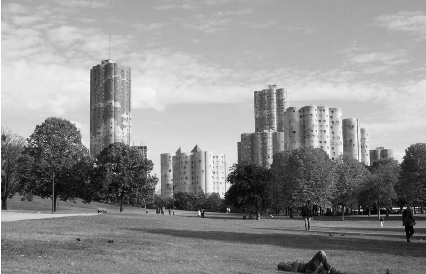
FIGURE 1. Nanterre, a western banlieue of Paris.