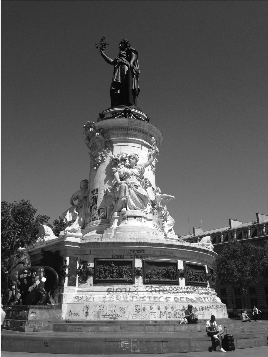
FIGURE 3. Place de la République.