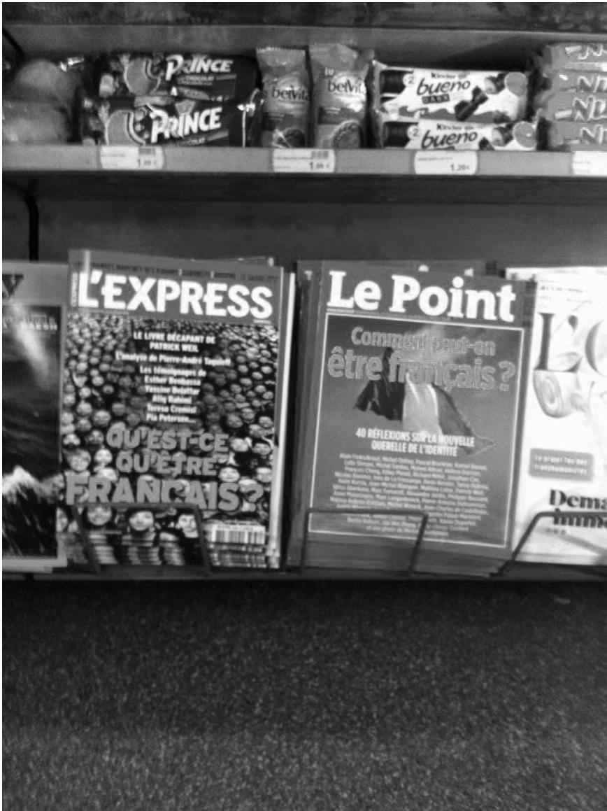
FIGURE 2. Covers of two French newsmagazines, L'Express and Le Point , with features about what it means to be French, at a Parisian newsstand in 2015.