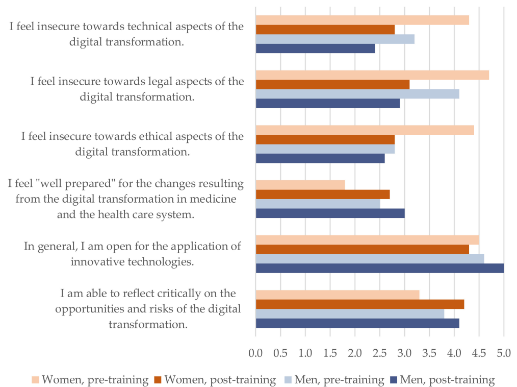
Figure 3. Self-evaluated attitudes regarding physicians' empowerment for the digital transformation pre-training vs. post-training for n = 32 participants compared for gender.

Hypotheses H1—Knowledge. There was an overall multivariate effect for condition in the MANCOVA, pointing out differences in self-evaluated knowledge before and after the training (Wilks' lambda = 0.190; F(19, 37) = 8.29 ; p < 0.0001 ). Gender as a covariable did not reach significance (Wilks' lambda = 0.689; F(19, 37) = 0.88 ; p = 0.606 ).