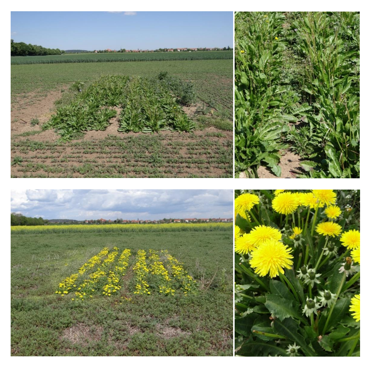
Fig. 3: Phenology of a Taraxacum – 'Hybrid 207' – plot within agricultural land of the Julius Kühn Institute, Quedlinburg. Upper row: 21 May 2018, lower row: 27 Apr. 2019.