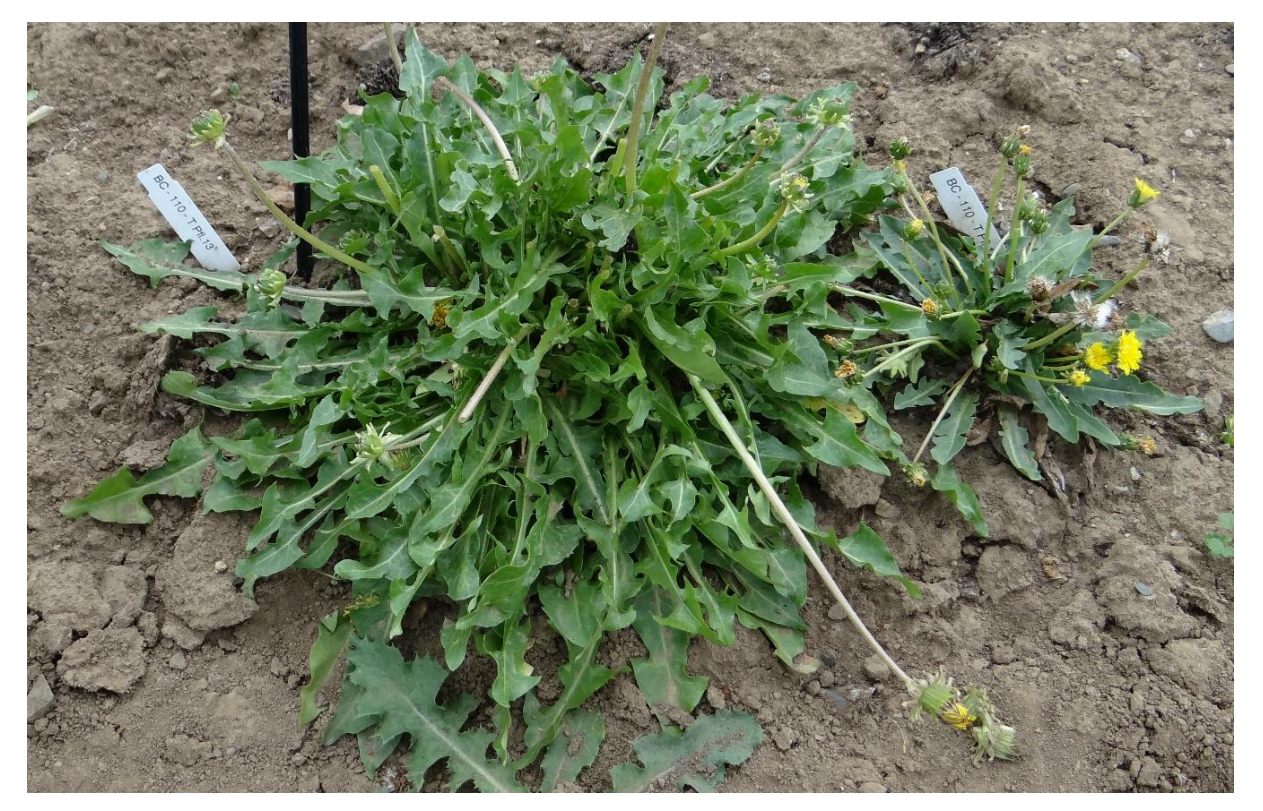
Fig. 6: T. koksaghyz \times (T. koksaghyz \times T. linearisquameum, Vienna 2) , Julius Kühn Institute (JKI), Quedlinburg; 13 June 2021, I. Uhlemann. Left: Hybrid. Right: T. koksaghyz.

Rubber content: 1.17–1.43 %, average: 1.31%. Three plants were tested.