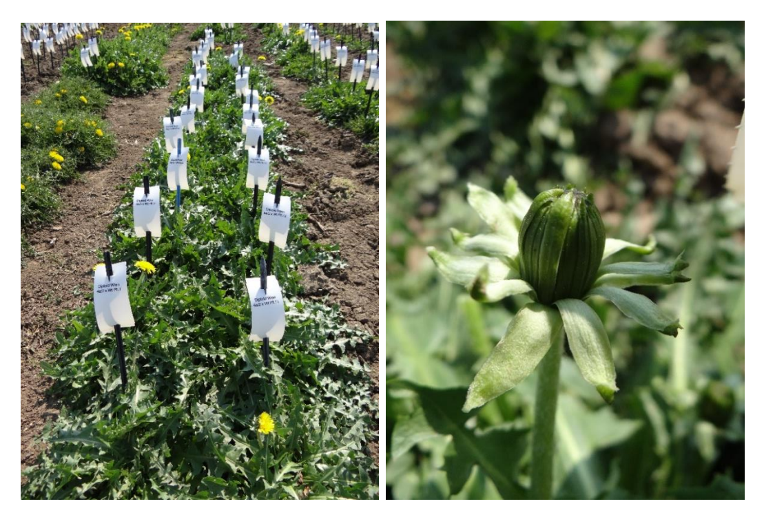
Fig. 5: T. linearisquameum (Vienna 4) \times T. koksaghyz , Julius Kühn Institute (JKI), Quedlinburg; 6.4.2019, I. Uhlemann; A – view to plot; B – capitulum.