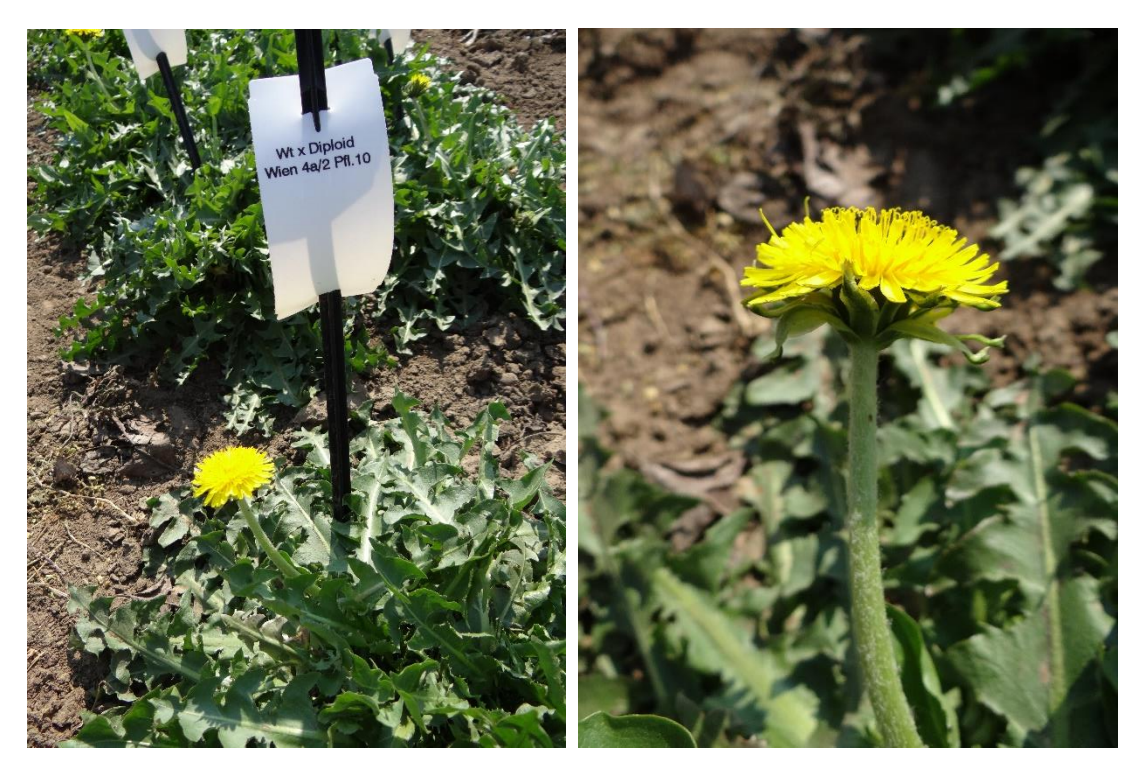
Fig. 4: T. koksaghyz \times T. linearisquameum (Vienna 4), Julius Kühn Institute (JKI), Quedlinburg; 6 Apr. 2019, I. Uhlemann; A – view to plot; B – capitulum.

Rubber content: 1.4–3.7 %, average: 2.3 %. 5 plants were tested. It is the highest rubber content observed in all hybrids, even as high as in some T. koksaghyz types. Ploidy level: 2n=2\times=16 .