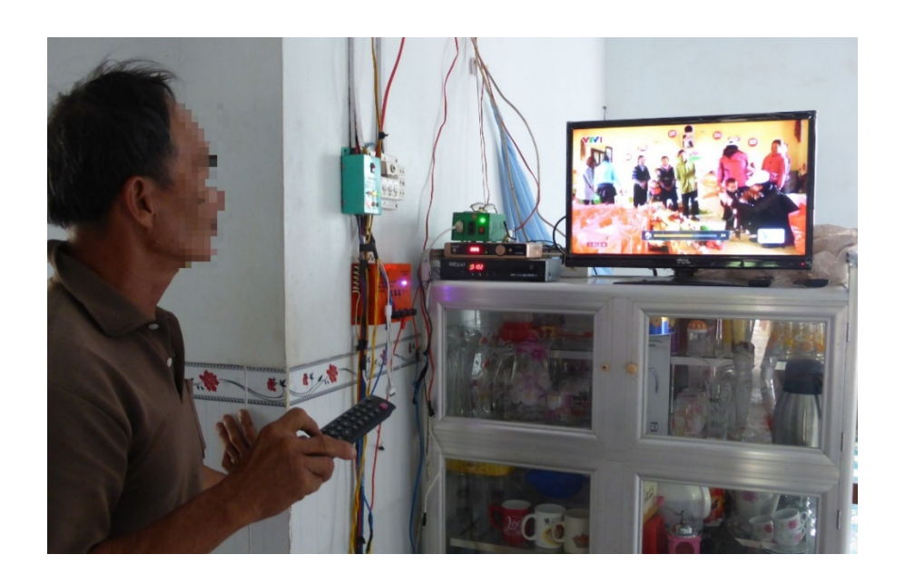
Figure 9. A low-voltage television set is the central appliance in the household system

from the state and capitalist forces, actively deciding how they live their energy and social lives (Forde 2020) because off-grid infrastructures are claimed to be "more progressive, efficient and democratic than 'grid-based' alternatives" (Cross 2017, 208). Evidence in An Hao commune demonstrates that the freedom of off-grid energy-users is conditioned at least by economic and technical contexts. Users might not be subject to the state and capitalist forces via the technopolitical grid, but when their energy use is conditioned by their lower incomes and limited equipment, they are heavily subject to the availability and intensity of sun, wind and other natural phenomena. They might not be disciplined by an electricity meter, but certainly are by the capacity of their power-generating systems, which is usually low in poor areas like An Hao commune. There is no escape from "technologies of power" and "technologies of the self" (Foucault 1988) once people with scarce resources decide they want to be part of an electrified society, even when they belong to the latter through decentralized systems powered by renewables.