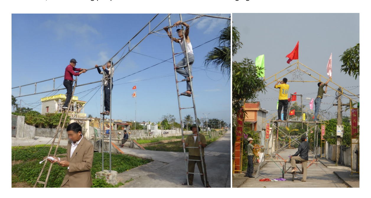
Figure 10. Maintaining LED welcome arches before the Lunar New Year, 2019