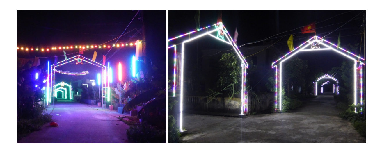
Figure 5. LED welcome arches on the commune's alleyways