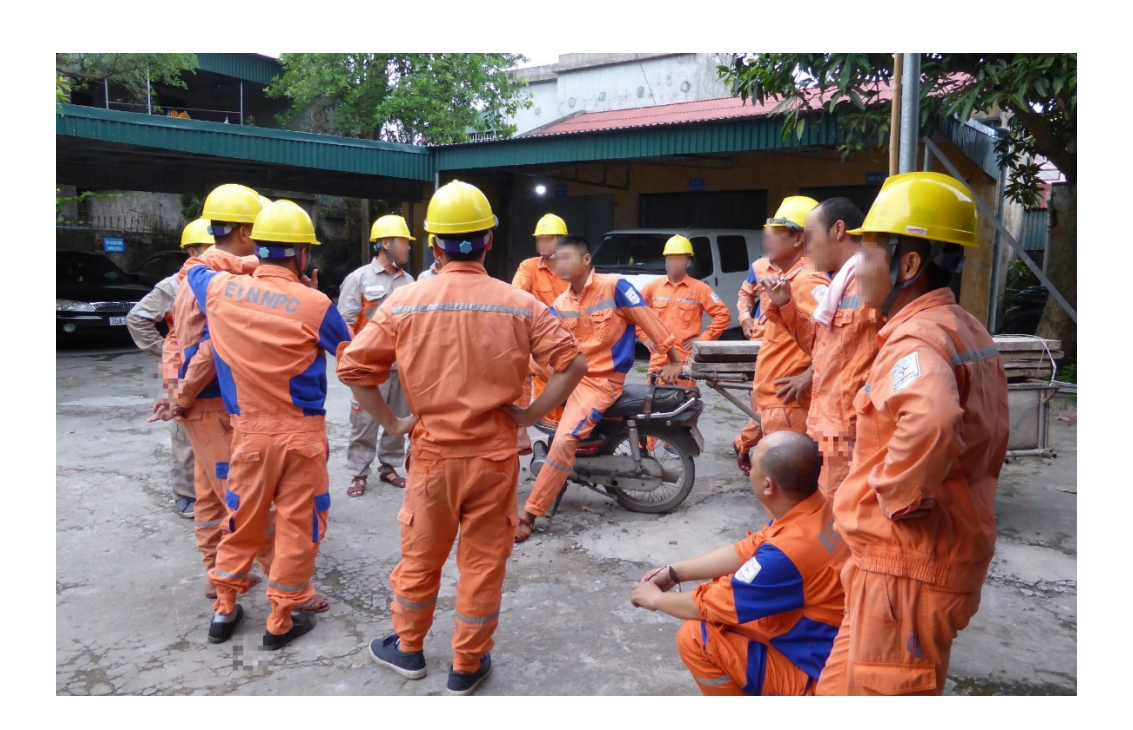
Figure 8. A work meeting before departing for the day

Following the strand of argument in the previous chapter, the instrumentality of electricity workers is nuanced by the hybrid ethical positioning they adopt between the "power" and the "people", as well as by the values they uphold individually in their relations with the rural consumers they work with every day and at times of crisis. These values could be attuned but could also well be in conflict with the company's regulations and the stated values of their management. The articulation between personal values, sectoral values and the state's values makes workers' instrumentalization by no mean a monolithic pattern or a machine process. Instead, their varied everyday practice of the profession could be viewed in terms of the ethical utilization of their identities and of the power to which they are entitled and are authorized to use as personnel. By exercising everyday ethics and freedom in their professional lives, they occupy a peculiar position that is separate from the people, relatively autonomous from their managers and not necessarily bound to a specific workplace at a district branch such as Hoang Hai Power: they are "công nhân điện lực" — workers of the power industry.