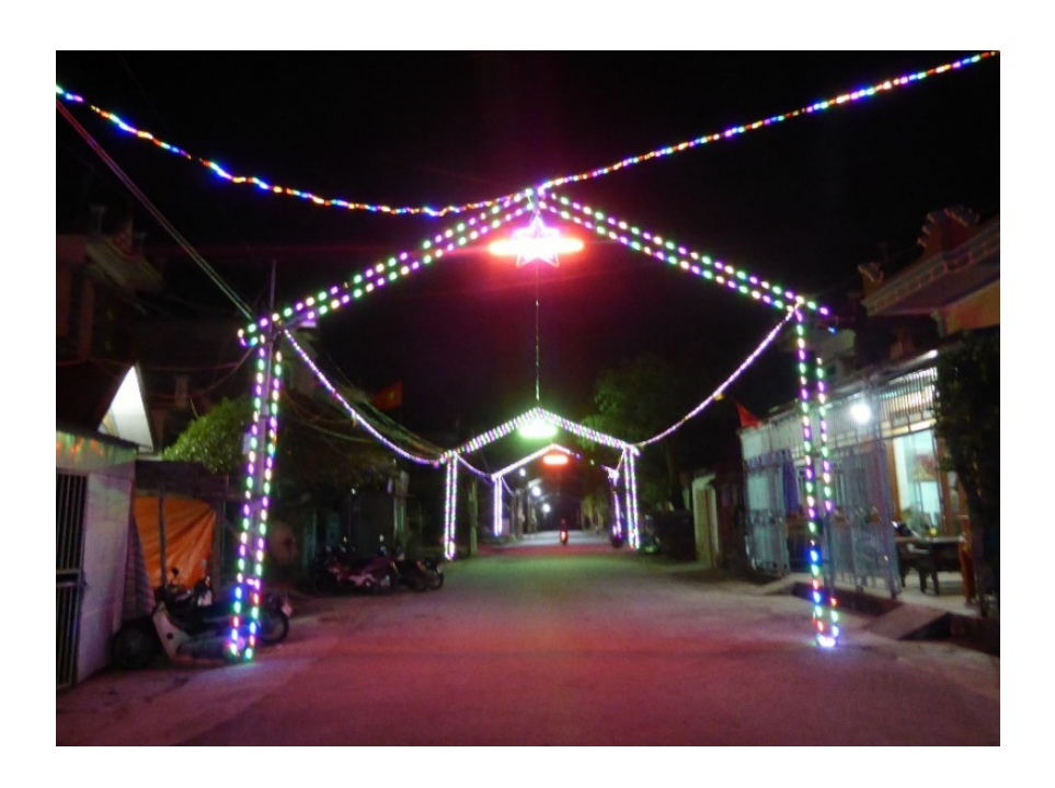
Figure 2. LED welcome arches on the commune's main road

lights they switched on every evening and on festive occasions kept on until very late. There is a shared excitement in seeing their commune as bright and beautiful "as a city" (nhur thành ph\delta "). It is noteworthy that the word they use, "thành ph\delta ", in Vietnamese, refers to a capital city, a big city, or at least a provincial capital like Thai Binh city, not to any smaller township of a district. Reasoning about the right size for comparative purposes did not seem to have any significance for their excitement. This is probably because this "city-ness" is associated with something they called "tinh thần", "khi thể" or "không khi" – spirit, atmosphere or vibe – rather than the size, of their land.