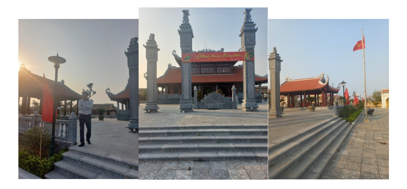
Figure 11. New construction of Uncle Ho Temple in the completion phase, March 2023

During the COVID years of 2021 and 2022, I heard "good news" on another bid by Dong Phong to make space for political beliefs from its Chairman of People's Committee. The commune was honored by being awarded the state's First-Class Labor Order ( Huân chương Lao động hạng Nhất ), <sup>63</sup> conferred at the same time its new primary school was completed and inaugurated. More importantly, a large new temple to "Uncle Ho" was under construction on the site of the older, now demolished shrine, with a total budget of over one hundred billion ( hơn một trăm ti ) Vietnamese dong , equivalent to nearly five million US dollars. Granted by the central state, this budget is an enormous amount for a construction project in a small commune of three thousand people. It is apparently a bold bid to transform the "Uncle Ho cult" and its vibrancy in the small territory of this new land (see Chapter Three) into a truly "political religion" (see Dror 2016) capable of influencing the whole coastal region of Thai Binh province, where Christianity and Buddhism have long exposed the population to their mixed influences. The question of how political religion(s) continue to be exercised in rural communities deserves an investigation in its own right in a further study.