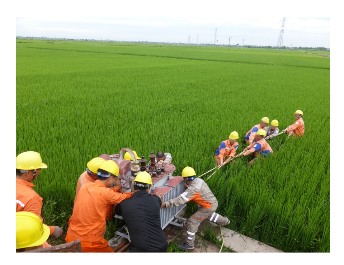
Figure 7. General Team Number Two relocates a transformer, summer 2019