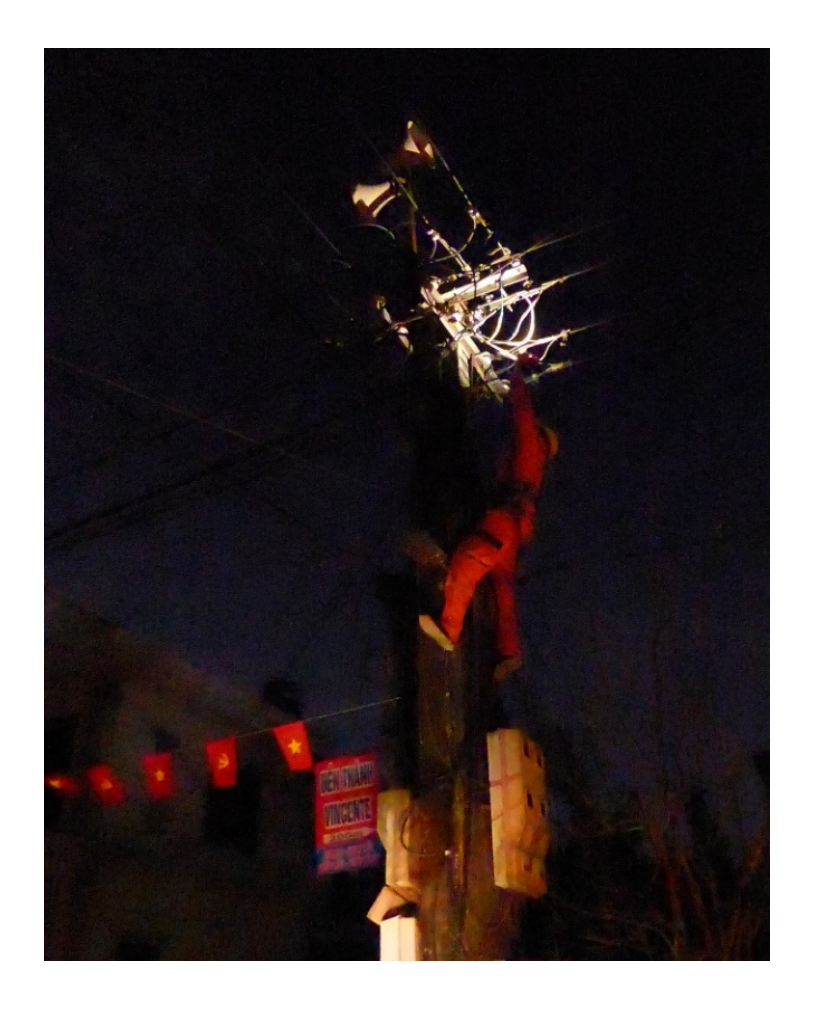
Figure 6. Fixing an occurrence (sự cố) on Lunar New Year's Eve 2019

Vital to this strategy is the physical presence of electricity workers in the communes throughout the night to cover the system failures and assure customers that the company is taking care of the situation. Unlike their managers, the workers I worked with do not say they "serve" anyone, whether their customers or the company. The term "serving", which will be elaborated on further later in this chapter, could have been far too flowery for the harsh facts they have to cope with as the human frontier of the electrical infrastructure.