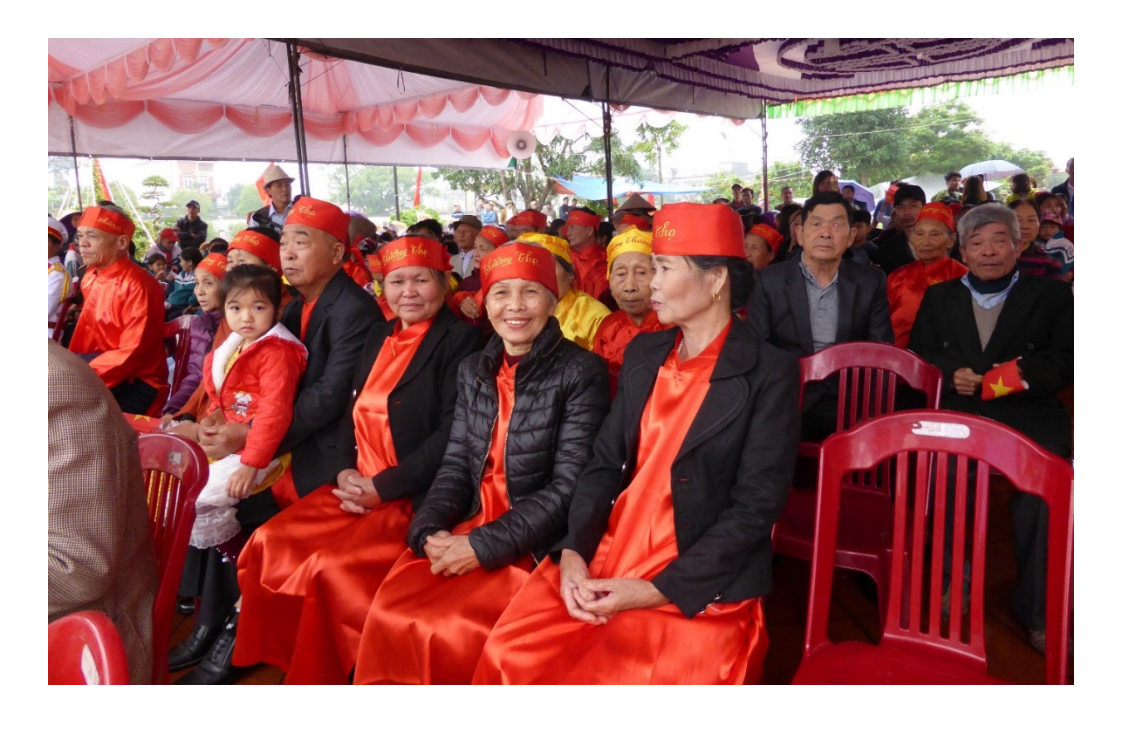
Figure 4. Celebrating Longevity on the anniversary of Uncle Ho's visit, March 2019