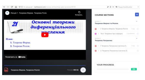
Figure 5: Course materials "Basic Theorems of Differential Calculus".

After the student has registered on the site, he starts studying, for example, on the course "Basic Theorems of Differential Calculus" (Figure 5).