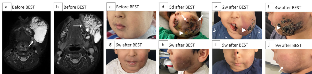
Fig. 2 Four-year-old male patient with subcutaneous lymphatic malformation (LM) of the left cheek undergoing one bleomycin electrosclerotherapy (BEST). a, b T2-weighted, axial magnetic resonance images prior to treatment showing a partially micro- and partially macrocystic LM (arrows). c Clinical presentation of the patient prior to treatment including noticeable swelling of the affected region with consecutive mouth asymmetry. d Clinical presentation of the patient five days after BEST with extended postinterventional swelling (arrows) with consecutive dyspnea, which was strictly monitored, as well as skin alterations such as hyperpigmentation, necroses, and blebs (arrowhead). As oral food intake was not possible, the patient was fed intravenously, and prednisolone was administered. e–h The decreasing swelling and good healing of necrosis and blebs over time (arrowheads) while the distinct hyperpigmentation on the treated skin was pronounced on the maximum. i, j Significant reduction of skin hyperpigmentation six weeks after BEST (arrow) compared to ( h )

sequelae (grade 3). After 8/325 (0.9%) BESTs, significant scar formation occurred that did not resolve > 30 days postoperatively (late complication, grade 4).