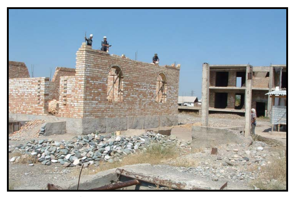
The construction of the 28<sup>th</sup> mosque, with a set of never-completed apartment buildings from the Soviet era in the background