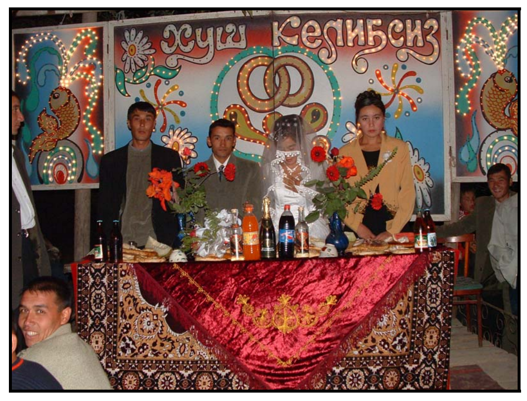
A "typical" evening wedding party