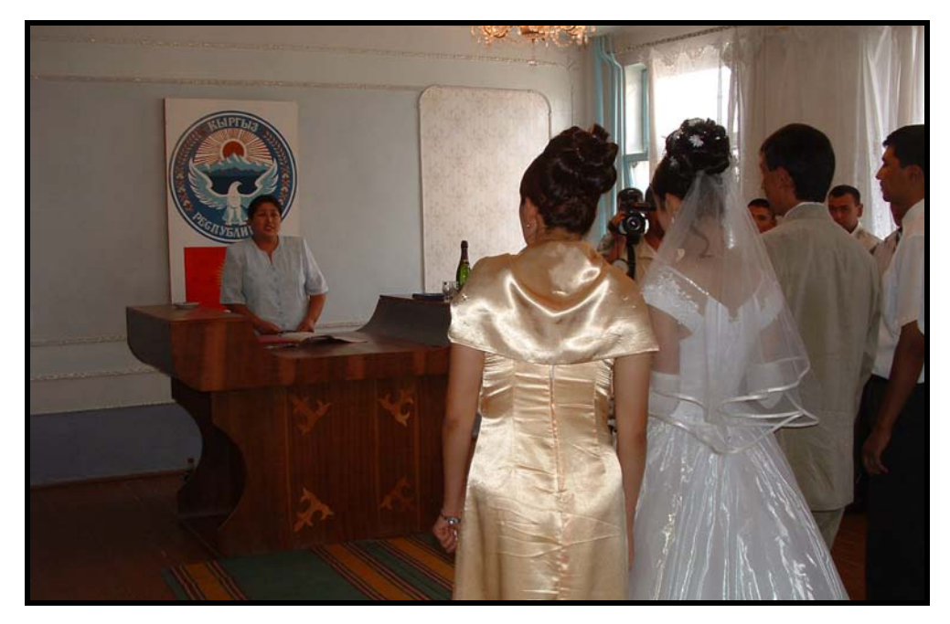
A wedding ceremony at the raion ZAGS offices