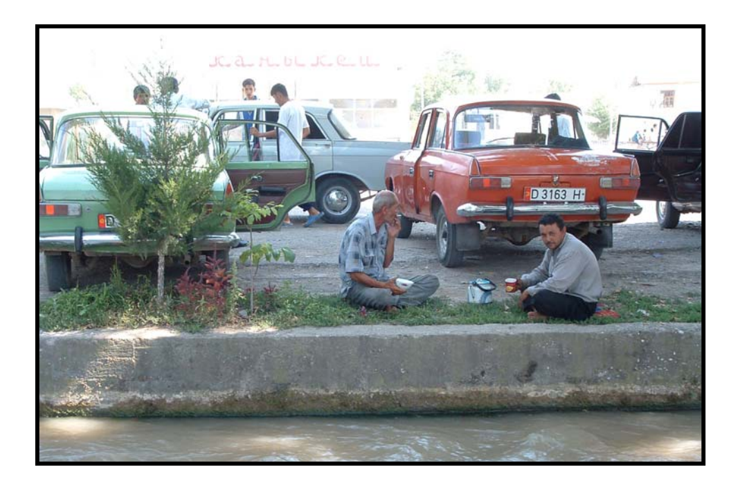
Forced to forsake their professions because of unemployment, these taxi drivers wait for the precious little business that comes along.