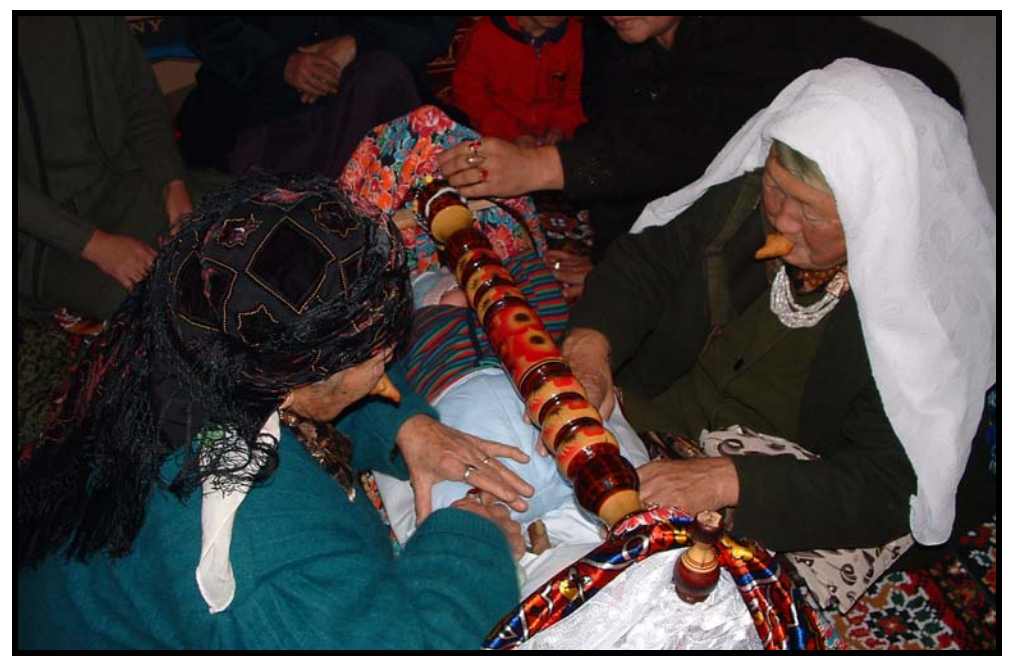
The keeping of life-cycle rituals like the Beshik Toi (cradle ceremony), are criticized by the newly pious, but understood as inherently Islamic by practitioners.