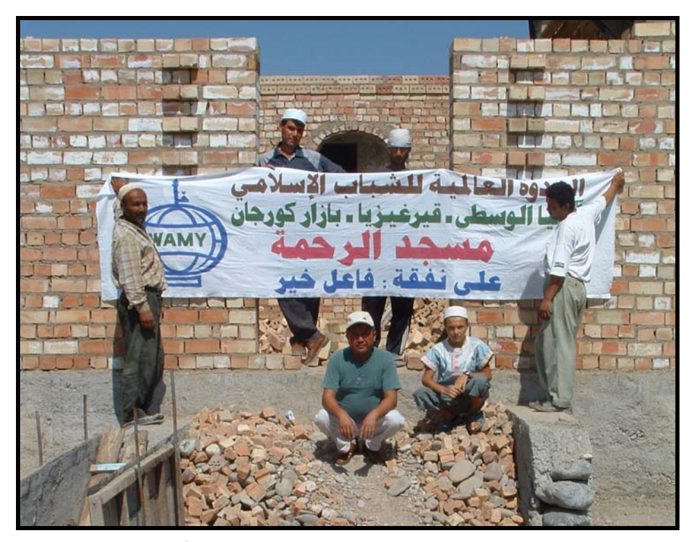
The construction of the 28<sup>th</sup> mosque. The banner notes that WAMY and an anonymous donor have sponsored the project.