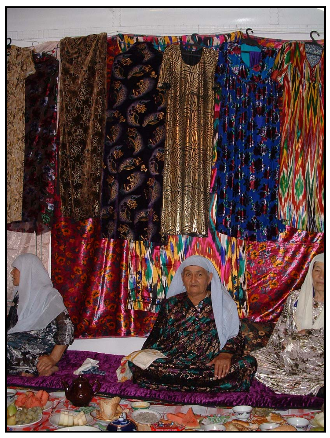
A bride's sep which include dresses unfit for a newly pious woman