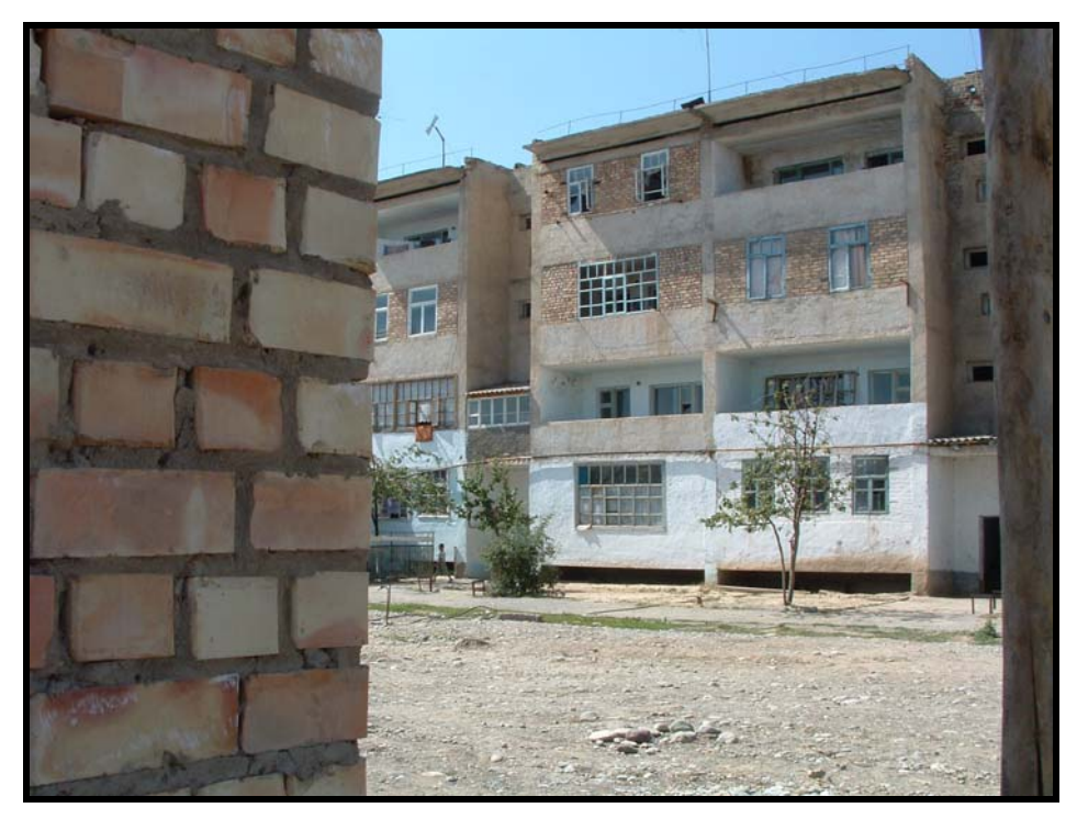
The formerly prestigious apartment buildings