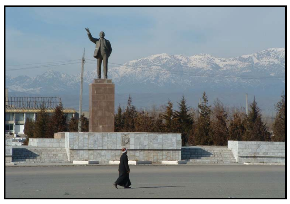
Statue of Lenin, Bazaar-Korgon, 2004