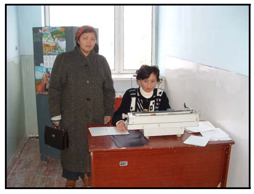
Women of the same age cohort, the secretary to the town mayor (R) does not veil, while the administrator of a local day care center, visiting the mayor, (L) does.