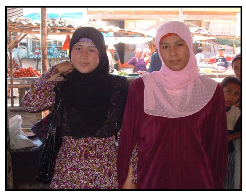
Women who "wear their scarves like this"