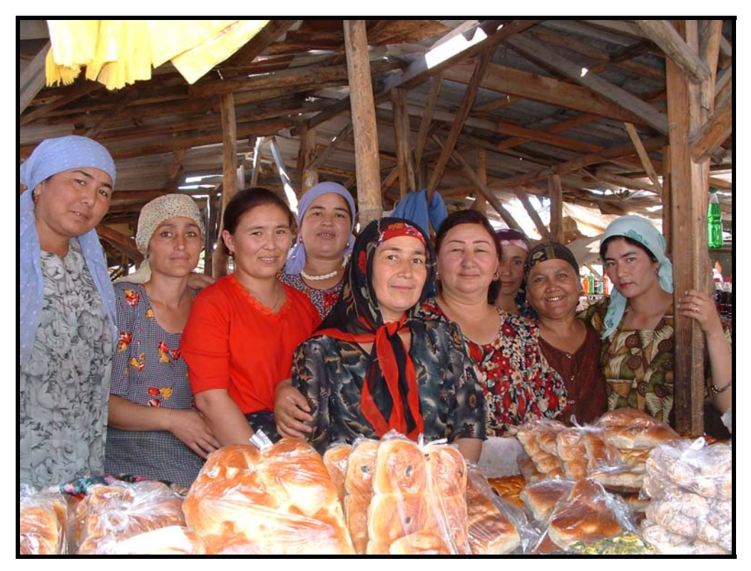
Women who do not "wear their scarves like this"