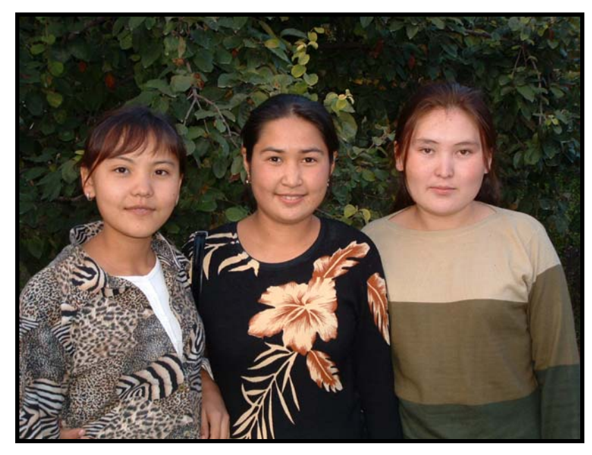
Part of the range of acceptable veiling - unmarried women in their early twenties