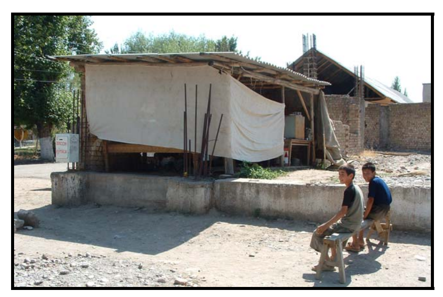
Toktosun also hopes to find funding for the construction of a building at this site adjacent to the mosque. It would be a place of prayer for women.