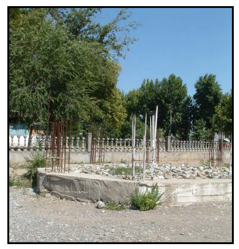
The foundation for the minaret at the Raion Friday Mosque was laid, but never complete. Funds are being sought for the project.