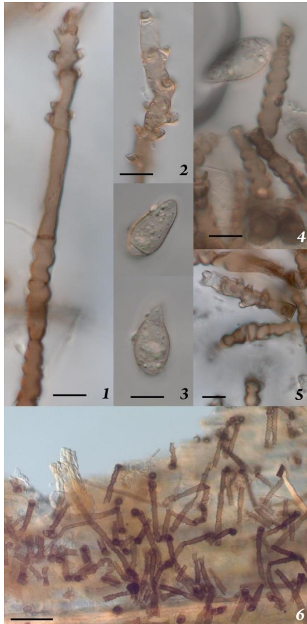
Figs 1–6: Pyricularia contorta . 1. Conidiophore. 2. Conidiogenous cell. 3. Conidia. 4–5. Fragments of conidiophores. 6. Colony with scattered conidiophores. Bars – 10 \mu\text{m} (1–5), 50 \mu\text{m} (6).