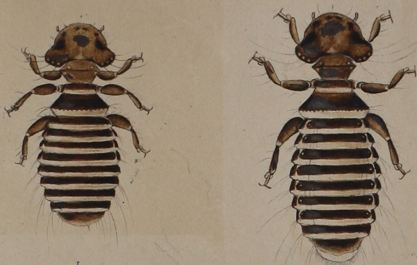
I II Leoth. Menopon. branneum. I ♀. Corvi caryocatactis. II. 62. 1817. IV. 100.