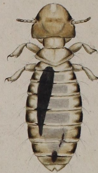
I Phil. Nirmus olivaceus. Corvi caryocatactis.