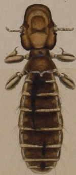
Phil. Nimus fuscus Falco. buteonis.