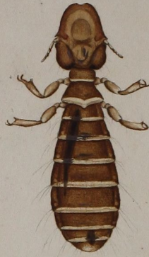
Phil. Nimus. Coracias garrulae. III. 338.