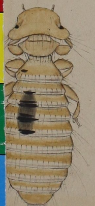
I Menopon. icterum. Isolop. rusticolae. II. 232.