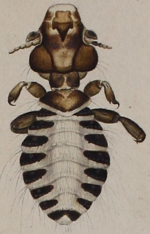
I Phil. Docoph. crassipes. Corvi caryoc.