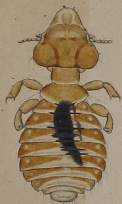
I Phil. Docoph. auratus Isolop. rusticolae. 1814.