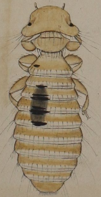
I Loth. Menopon. icterum. Isolop. rusticolae. II. 232.