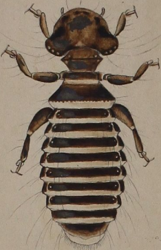
I 1/2 Loth. Menopon. branneum. I ♀. Corvi caryocatactis. 1814. IV. 100. II. 62.