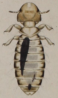
I Phil. Nirmus olivaceus. Corvi caryocatactis.