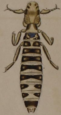
Phil. Lipcurus 4-pustulatus. Vult. Zinerei. Conf. IV. 25.