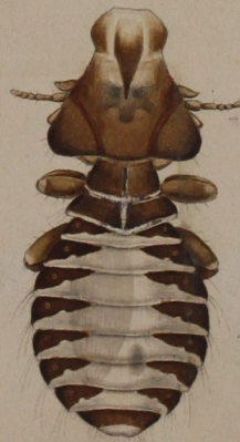
Phil. Docophor. platystomus. Falc. buteonis.