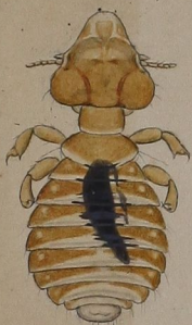
I h. auratus Isolop. rusticolae. 1814.