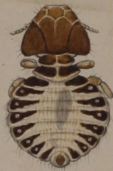
Phil. Docoph. brevicollis Vult. Zinerei IV. 26. 1816.