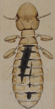
I Philopst. Lipeurus kelvolus I Isolop. rusticolae.