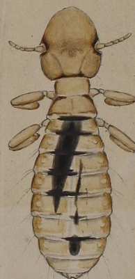
I Philopel. Lipeurus kelvotus I Isolop. rusticolae.